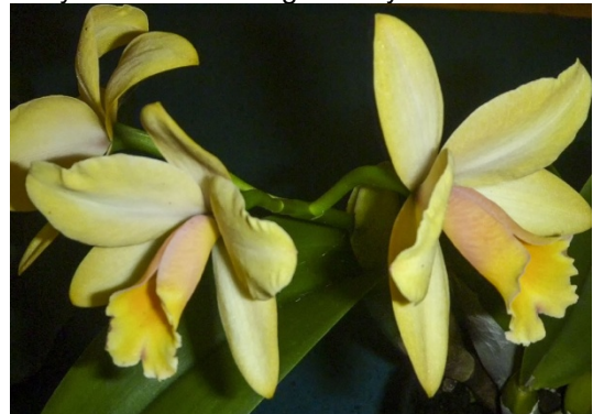
Laeliniiae hybrid 'Unknown' Grown by Herbert Chen