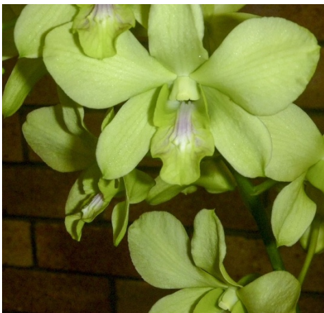
A very nice intermediate Dendrobium believed to be Den. Aridang Green 'Apple' grown by Herbert Chen