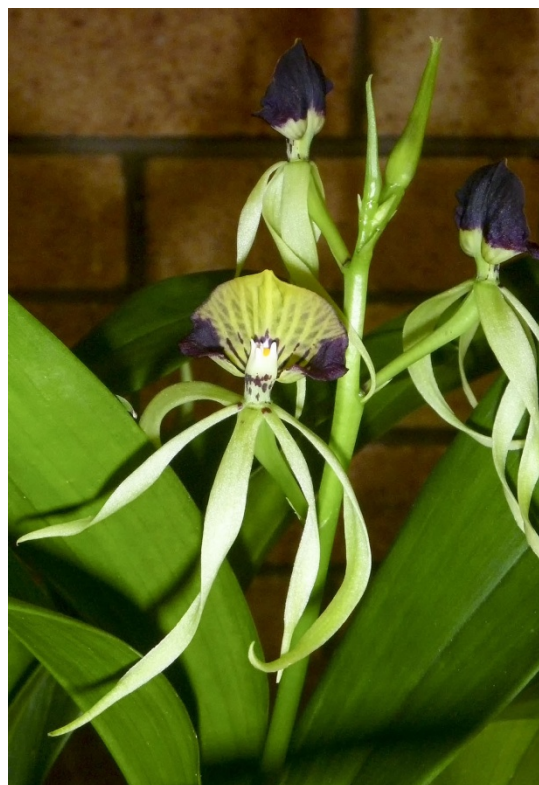
Prosthechea cochleata Grown by Mira Kostic