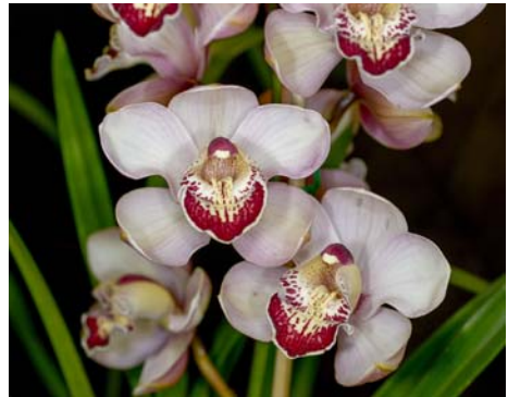
Cym. Khanebono X Cym Khan Flame Grown by Warleiti Jap