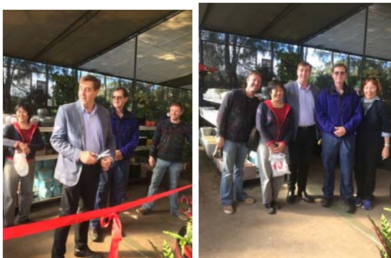
Grand Opening by the Deputy Mayor