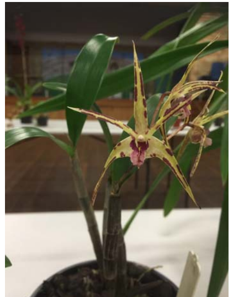
Dendrobium Walnut Valley Star grown by Warleiti Jap