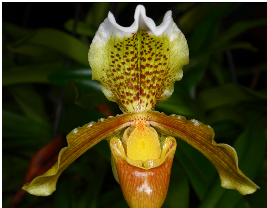
Paphiopedilum insigne 'Margaret' AM/AOC-NSW 2017