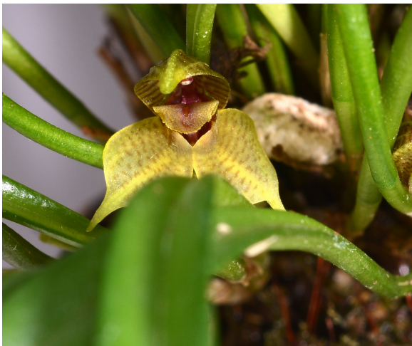
Dryadella simula grown by Warleiti Jap