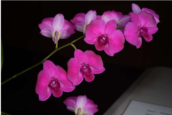
Dendrobium Unknown grown by Gavin Curtis