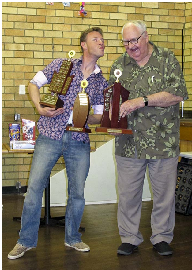
The Overall Open Class Winner