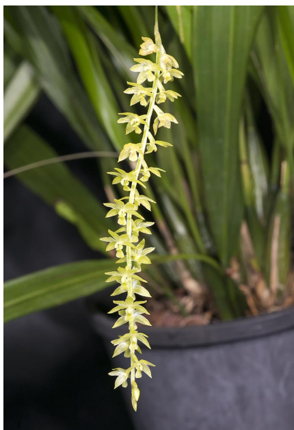
Dendrochilum uncatum grown by Cathy Starrett