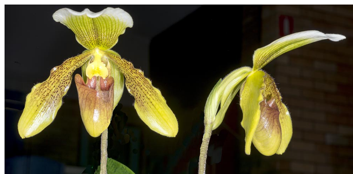
Paphiopedilum Tatonka A primary Hybrid Grown by Warleiti Jap