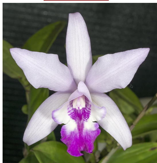
Unknown Laeliinia e grown by Mira Kostic