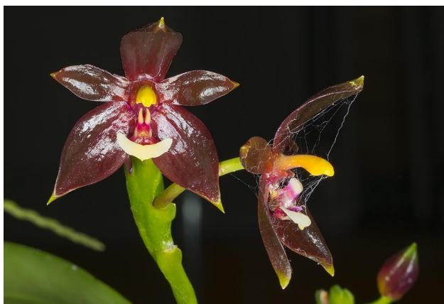
Phalaenopsis cornu-cervi a dark red form of this species. Grown by Warleiti