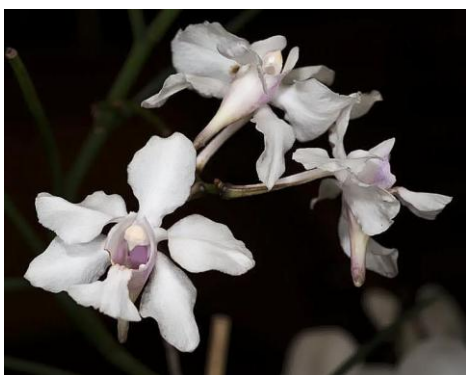
Papilionanthe Mundyi Grown by Warleiti Jap