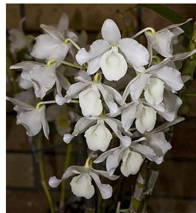
Softcane Dendrobium Grown by Graeme Mertz