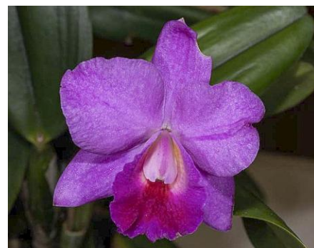
Cattleya Mini Jewel grown by Warleiti Jap