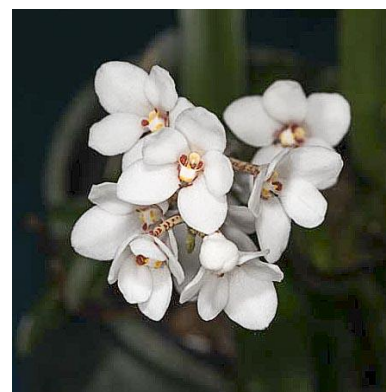
Sarcochilus Unknown Grown by Graeme Mertz