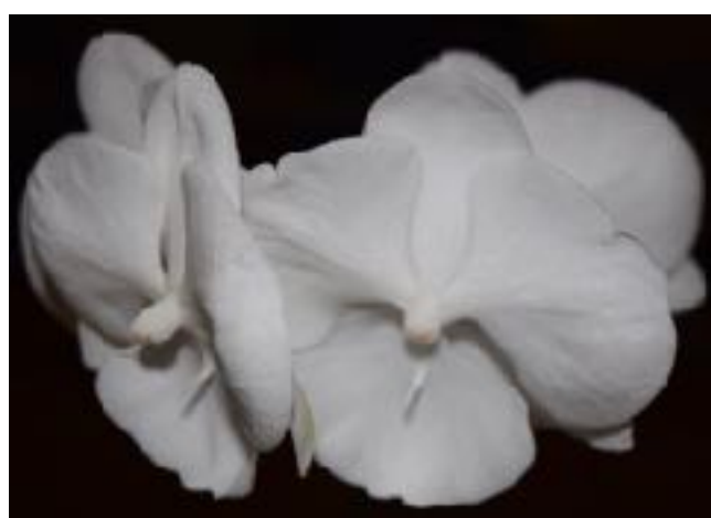
Phal. Younghome Princess 'White Pearl' grown by W Jap