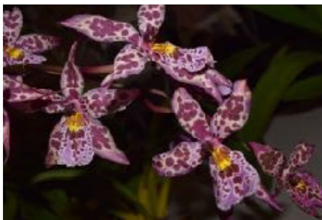
Oncidiinae Unknown grown by Buda Ivanisevic