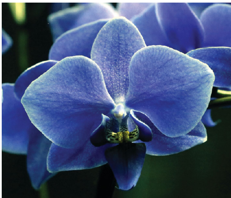
Phalaenopsis Wedding Parade