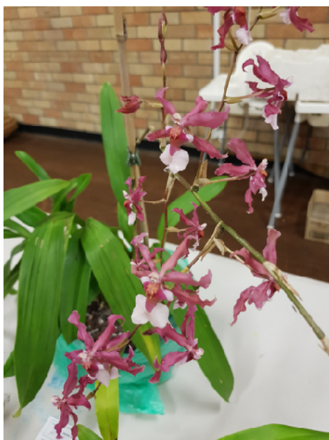
Oncidium trulliferum (W Jap)