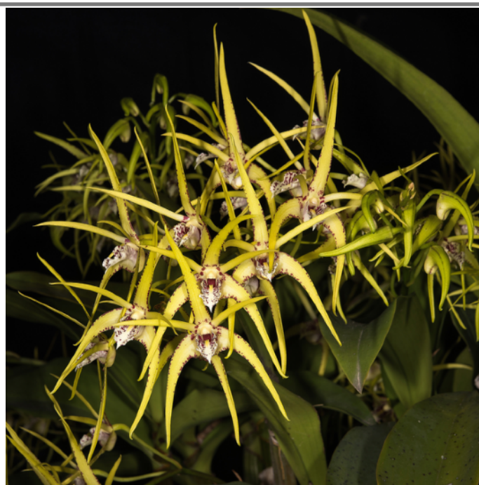
Dendrobium Greta Snow 'Cheryl' ( D. Jayden x D. speciosum )