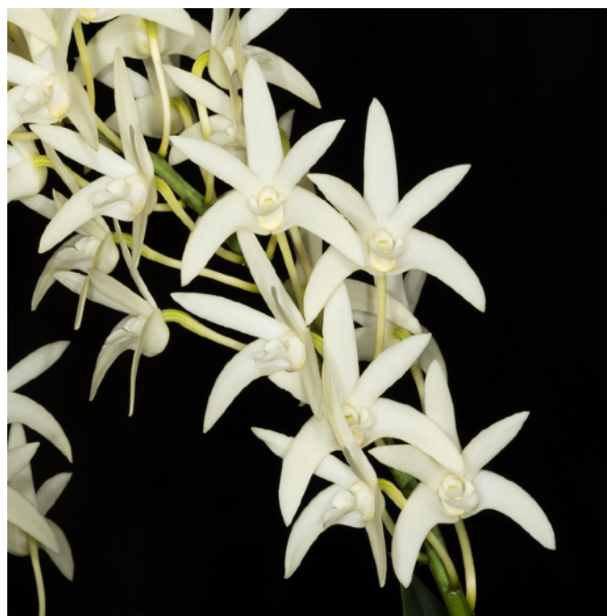
Dendrobium speciosum "Claire de Lune"