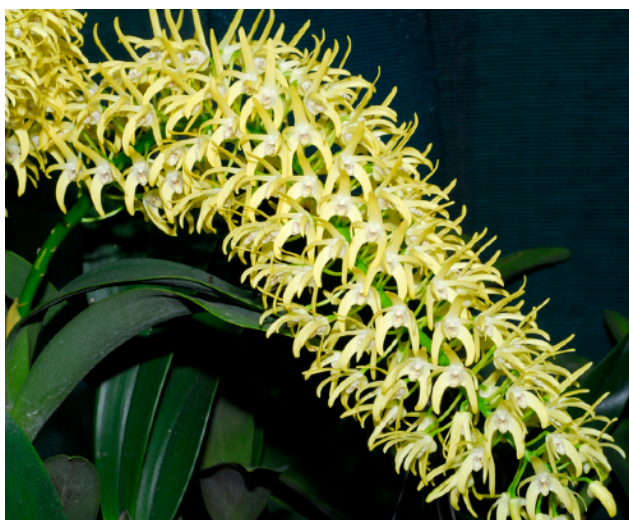
Dendrobium Cosmic Gold 'Sandy' ( D. Avril's Gold x D. speciosum )

Dendrobium speciosum is a very forgiving orchid. You can grow it in any garden wedged amongst some rocks, or take things more seriously and it will reward you handsomely. I grow my mature plants in a mixture of coarse bark, charcoal, and river pebbles under 30% shade cloth in shallow trays of water from October to April, and in full light with the water trays removed during the rest of the year. This gives me two to three growth spurts each year. They get a dose of 'Osmocote for Natives' in October, and Peters HiK and Seasol monthly. Dendrobium beetles will attack the new growths (but the frogs take care of most of those). Den. speciosum has been used extensively in hybridisation to increase flower count, strengthen the flower spike, and improve presentation. The kids will flower when they get to a moderate size but, like their parent, will be at their best when they grow into specimen plants with several flower spikes.