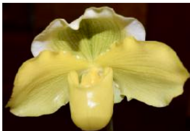
Paph. Magic Oro grown by Warleiti Jap (above) Catt. skinnerii grown by Warleiti Jap (left)

The views stated in this bulletin are not necessarily the views of The Eastern Suburbs Orchid Society, but are the views expressed by the individual authors & contributors. The Eastern Suburbs Orchid Society, authors & contributors to this bulletin disclaim all liability for damage or losses which may be contributed to the use, misuse or non-use of any information or material published in this bulletin.