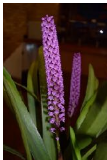
A stunning Arpophyllum giganteum (right) grown by Warleiti Jap