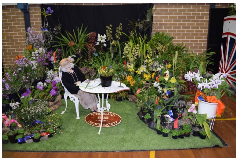
Sutherland Shire Orchid Society display (above) Who is that asleep?

The views stated in this bulletin are not necessarily the views of The Eastern Suburbs Orchid Society, but are the views expressed by the individual authors & contributors. The Eastern Suburbs Orchid Society, authors & contributors to this bulletin disclaim all liability for damage or losses which may be contributed to the use, misuse or non-use of any information or material published in this bulletin.