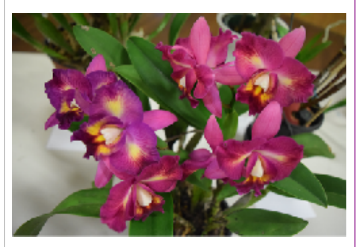
Herbert Chen grew this colourful hybrid ( Slc Angel Flare Janelle x Pot. Rosella Tokyo)