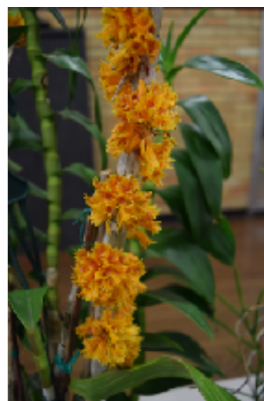
Warleiti Jap benched this unusual Den. bullenianum (right).

The views stated in this bulletin are not necessarily the views of The Eastern Suburbs Orchid Society Inc. but are the views expressed by the individual authors and contributors. The Eastern Suburbs Orchid Society Inc. authors and contributors to this bulletin disclaim all liability for damage or losses which may be contributed to the use, misuse or non-use of any information or material published in this bulletin.