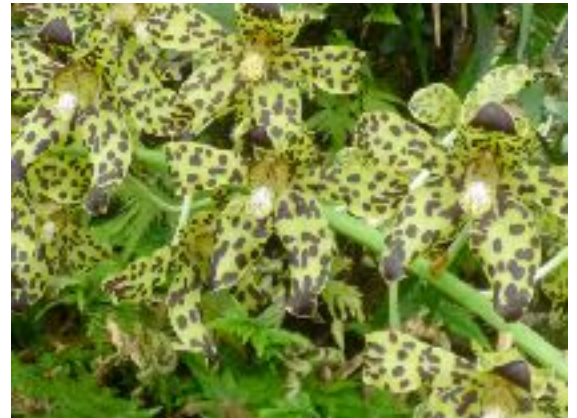
The Grammatophyllum sp. were over a metre long and just as wide.