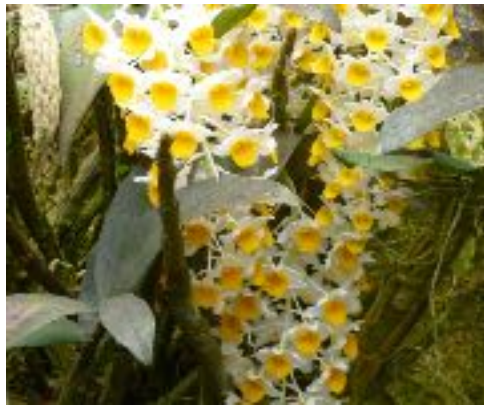
This Den. thyrsiflorum growing in rock (left) had at least sixty racemes on it.