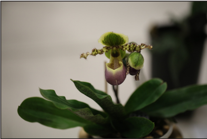
Paph. liemianum exhibited by Warleiti Jap