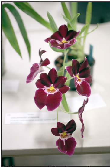
Miltoniopsis Hamburg Storm