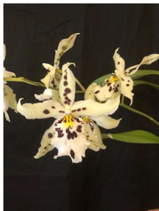
Aliceara Snowblind 'Sweet Spot' AM/AOS-2018