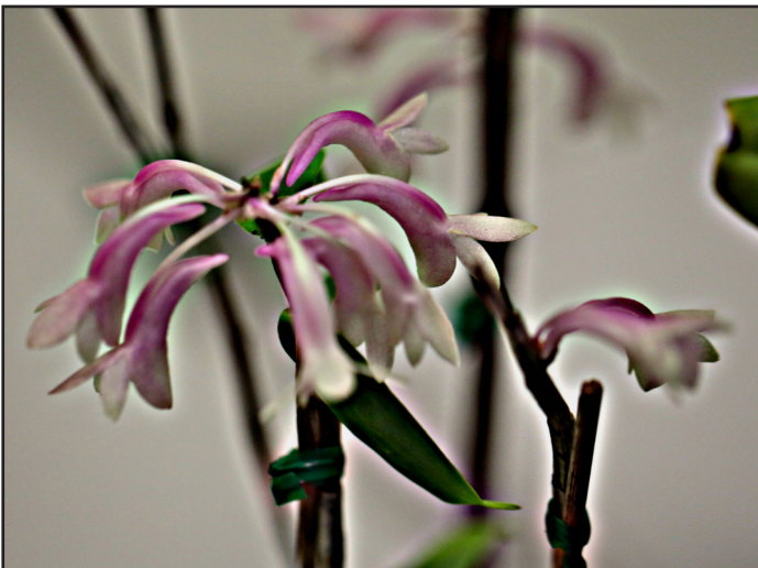
Den aphanochilum - Wareiliti Jap