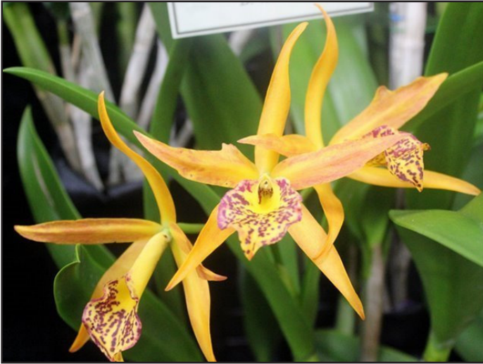
Bc. Starfire - Gavin Curtis