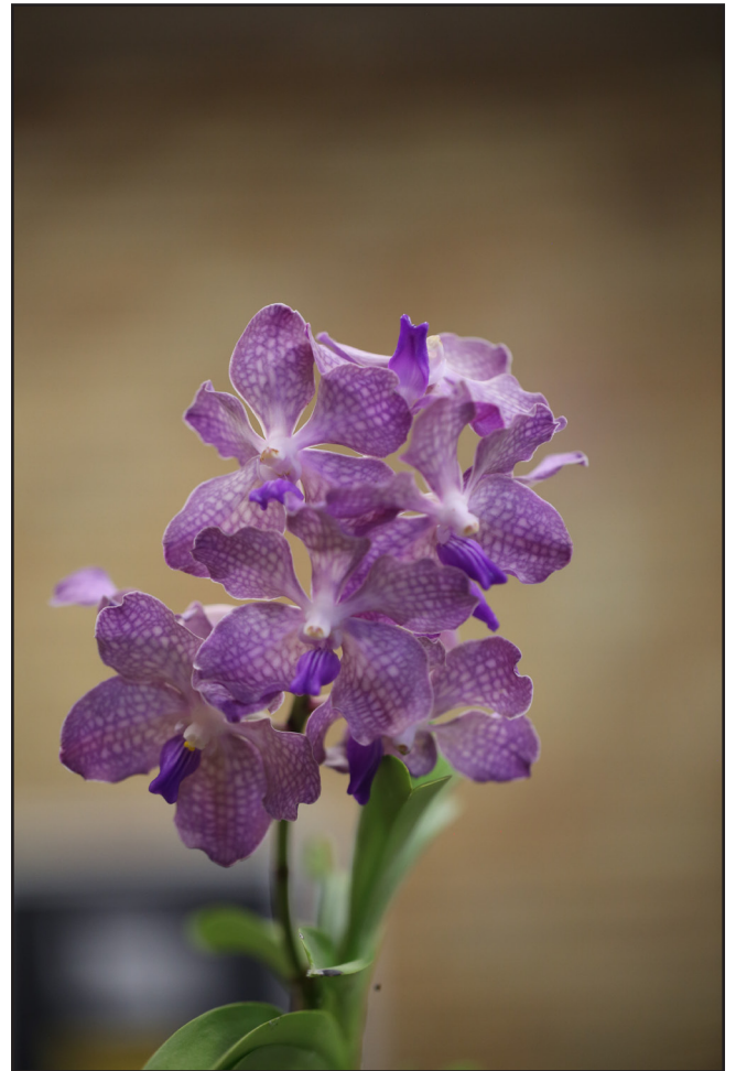
Mokara Unk - Gavin Curtis