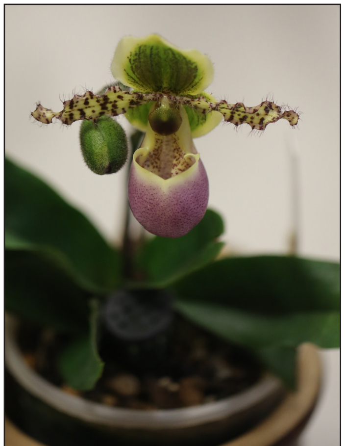
Paph liemianum - Wareiliti Jap