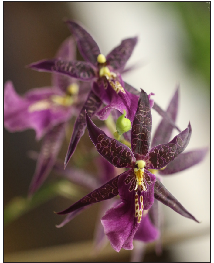
Bratonia Aztec - Buda Ivansevic