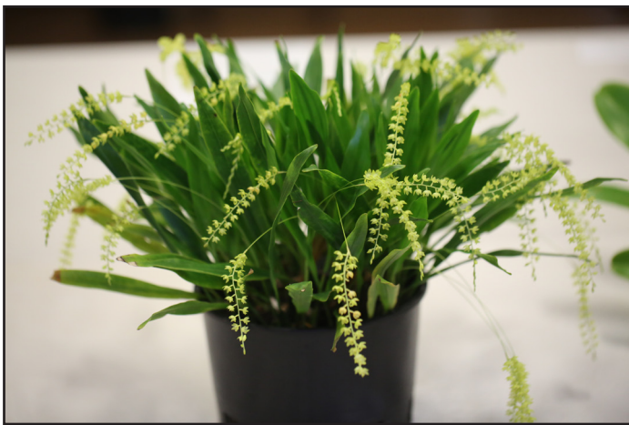
Dendrochilum uncatum ..- Cathy Starrett