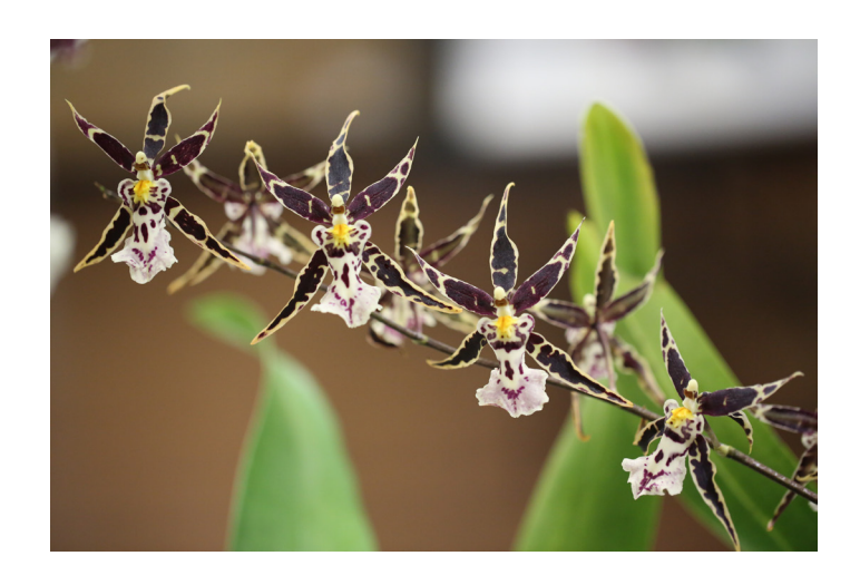
Brsdm Golden Gamine 'White Knight'