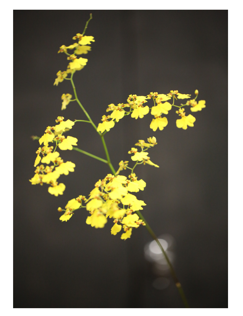
Onc. flexulosa EOS BULLETIN 2021-5