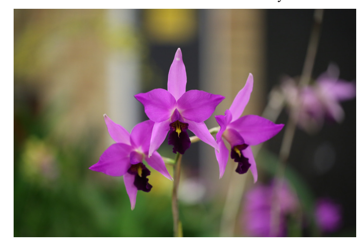
Laelia anceps 'Rosey Tiger'