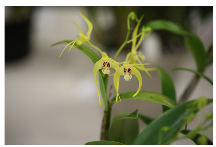
Dendrobium Hilda Poxon