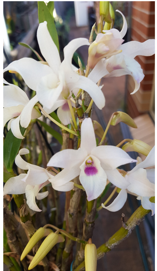
Den. Cassiope - Herbert Chen

The views stated in this bulletin are not necessarily the views of The Eastern Suburbs Orchid Society Inc. but are the views expressed by the individual authors and contributors. The Eastern Suburbs Orchid Society Inc. authors & contributors to this bulletin disclaim all liability for damage or losses which may be contributed to the use, misuse or non-use of any information or material published in this bulletin.