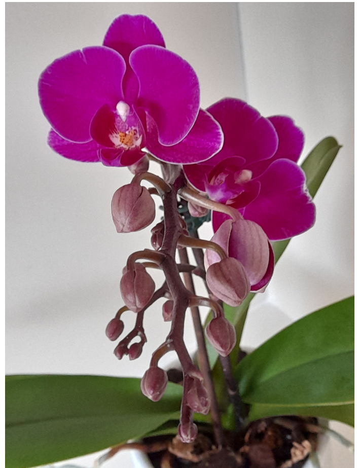
Class 34 3rd Phalaenopsis - Kylie Pelligreen