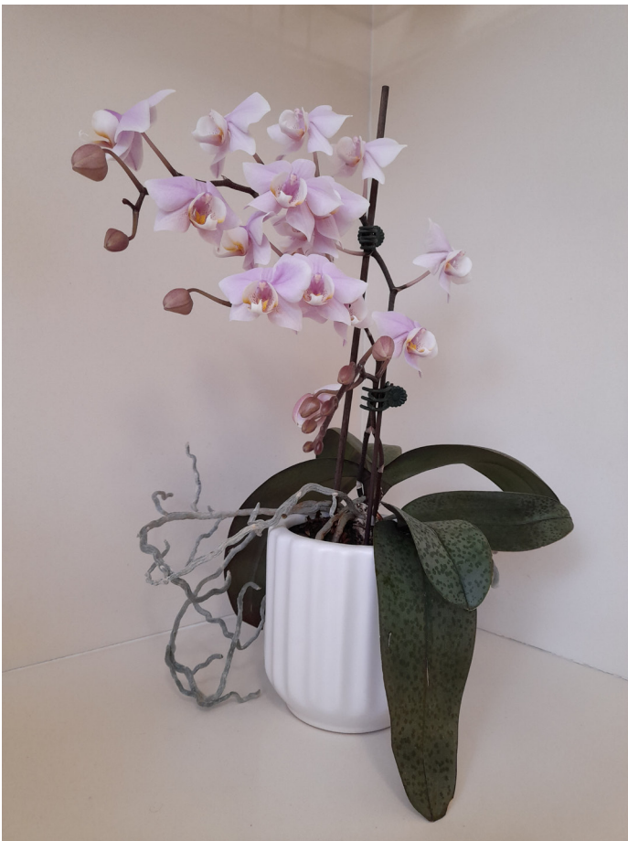
Class 34 2nd Phalaenopsis - Kylie Pelligreen