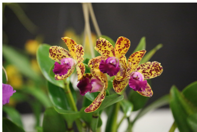
Rth Unknown - Judith Linton

The views stated in this bulletin are not necessarily the views of The Eastern Suburbs Orchid Society Inc. but are the views expressed by the individual authors and contributors. The Eastern Suburbs Orchid Society Inc. authors & contributors to this bulletin disclaim all liability for damage or losses which may be contributed to the use, misuse or non-use of any information or material published in this bulletin.