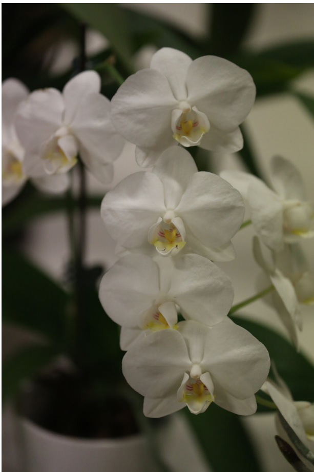
Phal. Unknown Kylie Pellagreen