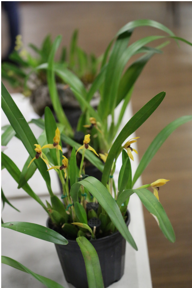
Max. cucullata - Warleiti Jap