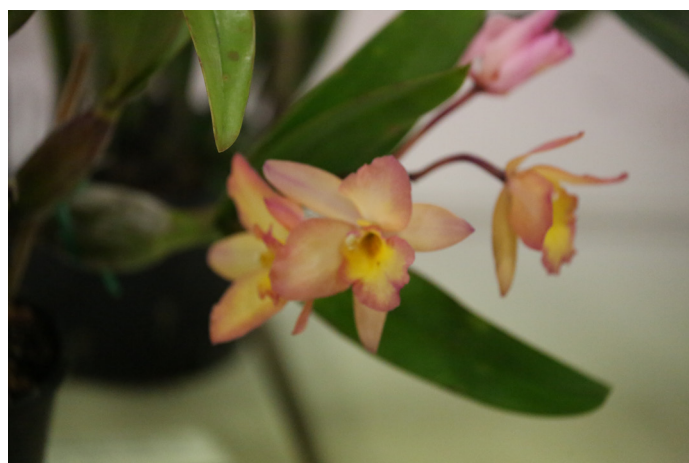
Jkf. Appleblossom - Warleiti Jap