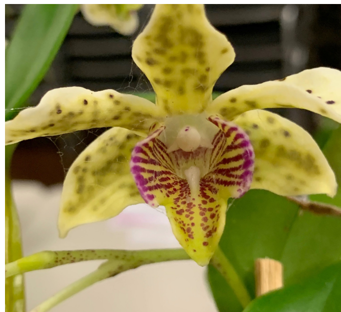
Dend. chocolate chip - Warleiti Jap