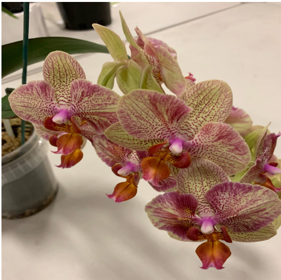
Phalaenopsis unknown - Buda Ivanisevic