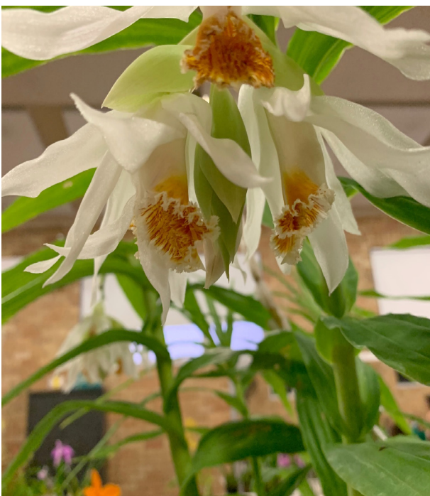
Thunia unknown