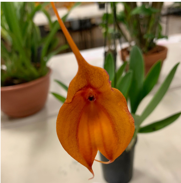
Masdevallia unknown