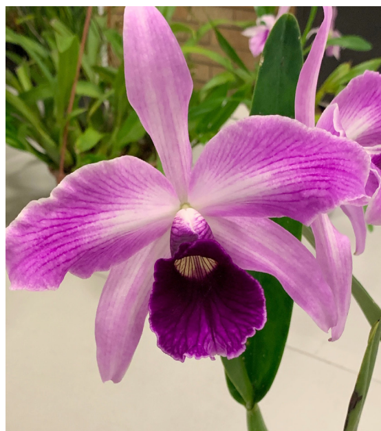
C. purpurata