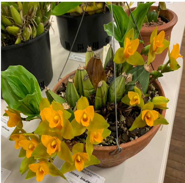
Lycaste bradeorum - Warleiti Jap