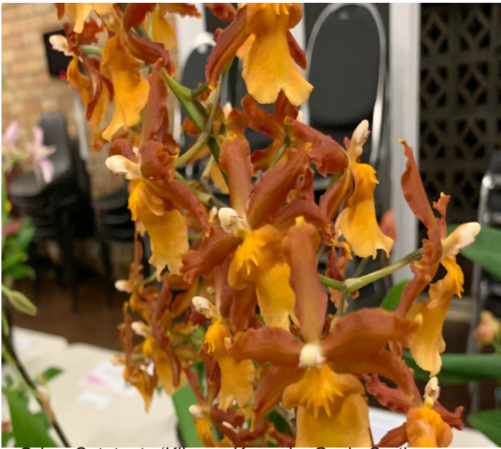
Odon. Catatante 'Kilauea Karma'