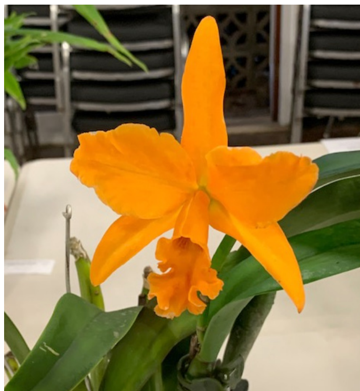
Rth. Lovepassion - Warleiti Jap

The views stated in this bulletin are not necessarily the views of The Eastern Suburbs Orchid Society Inc. but are the views expressed by the individual authors and contributors. The Eastern Suburbs Orchid Society Inc. authors & contributors to this bulletin disclaim all liability for damage or losses which may be contributed to the use, misuse or non-use of any information or material published in this bulletin.