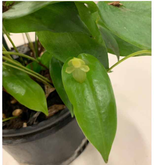
Pleurothallis semiscabra - Warleiti Jap