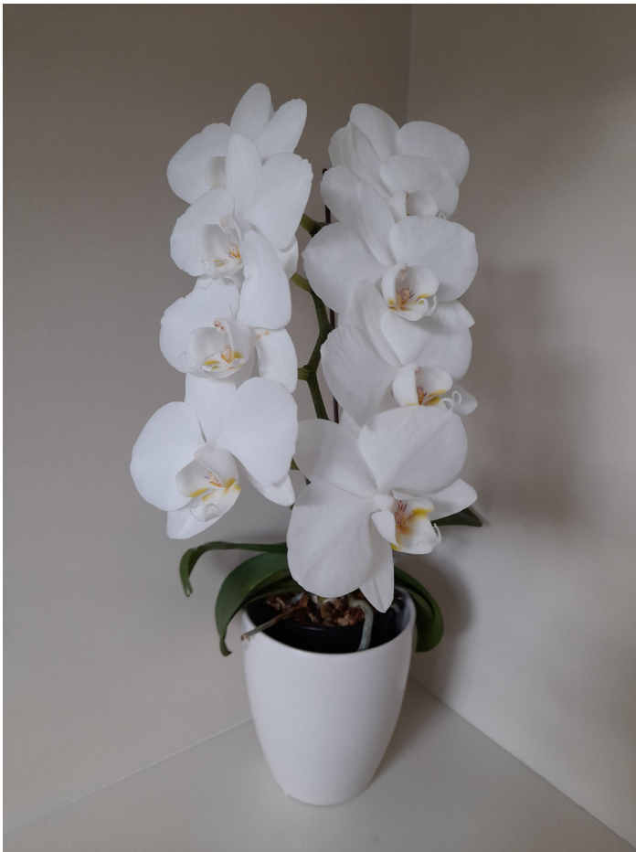
Class 34 2nd Phalaenopsis - Kylie Pelligreen