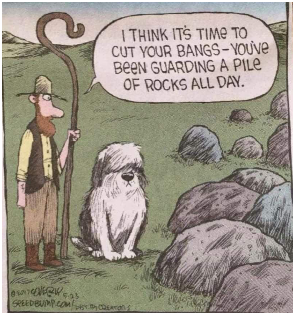
COVID hair style on a dog