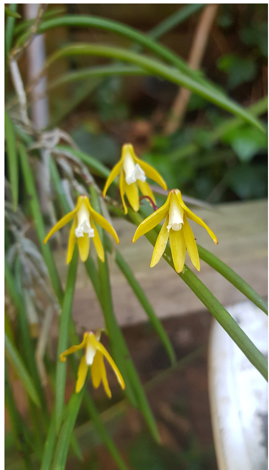
Dend. Unknown - Herbert Chen