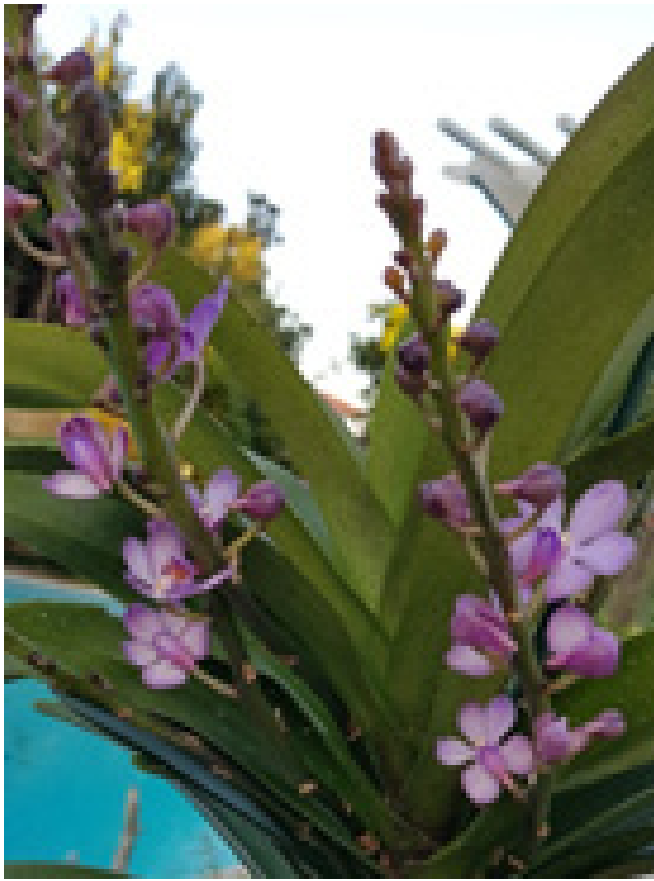
Class 35 Porterara Blue Boy - Judith Linton