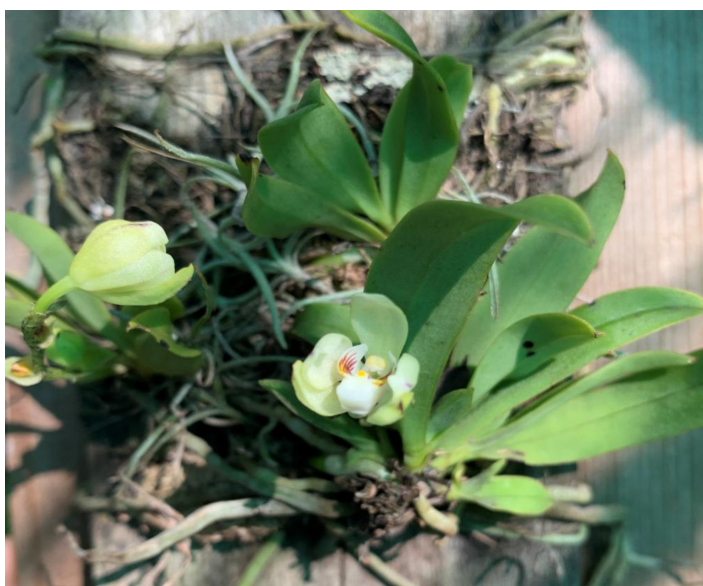
Sarco falcatus - Ross Trethewy