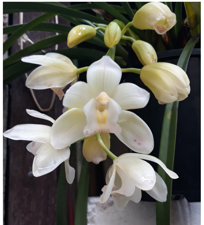
Cym. White Snow - Chao Ping