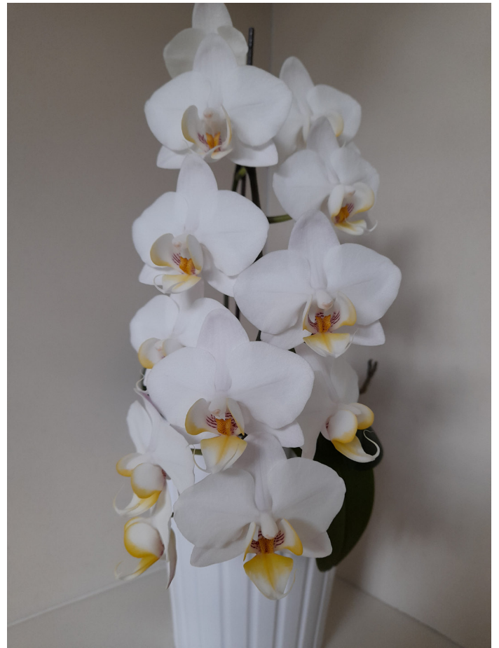
Class 34 3rd Phalaenopsis - Kylie Pelligreen