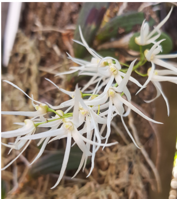
Den. linguiforme - Herbert Chen