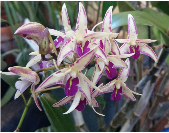
Den Burgandy Dream - Chao Ping y