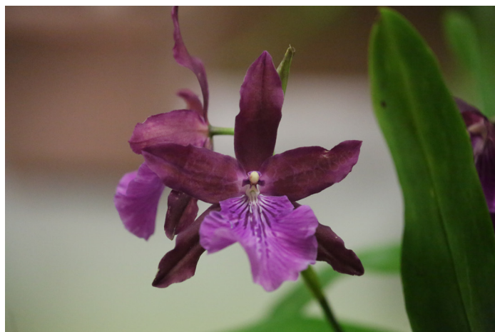
Miltonia Mary Mire - Chao Ping Li