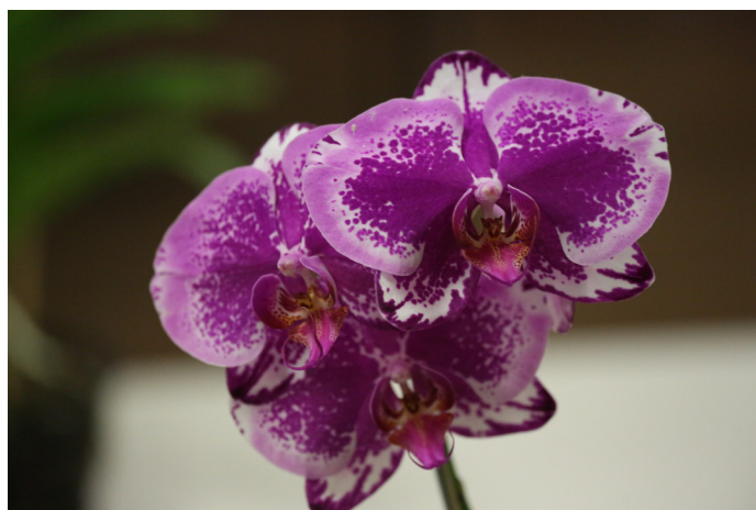
Phalaenopsis Ox Red Lion - Ross Trethewy