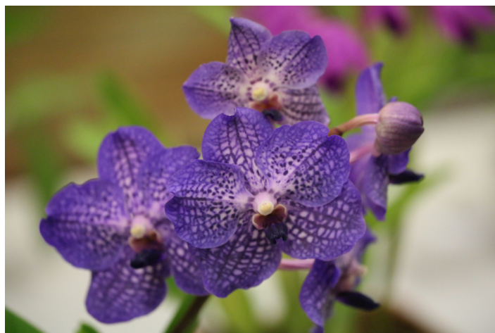
Vanda Somsri Glory 'Blue'. - Ross Trethewy

The views stated in this bulletin are not necessarily the views of The Eastern Suburbs Orchid Society Inc. but are the views expressed by the individual authors and contributors. The Eastern Suburbs Orchid Society Inc. authors & contributors to this bulletin disclaim all liability for damage or losses which may be contributed to the use, misuse or non-use of any information or material published in this bulletin.