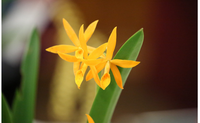
Procatavola Golden Peacock Kylie Pellagreen