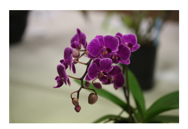
Phalaenopis Unknown Kylie Pellagreen

The views stated in this bulletin are not necessarily the views of The Eastern Suburbs Orchid Society Inc. but are the views expressed by the individual authors and contributors. The Eastern Suburbs Orchid Society Inc. authors & contributors to this bulletin disclaim all liability for damage or losses which may be contributed to the use, misuse or non-use of any information or material published in this bulletin.