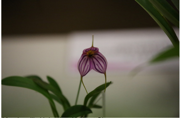
Masdevallia Unknoiwn Herbert Chen