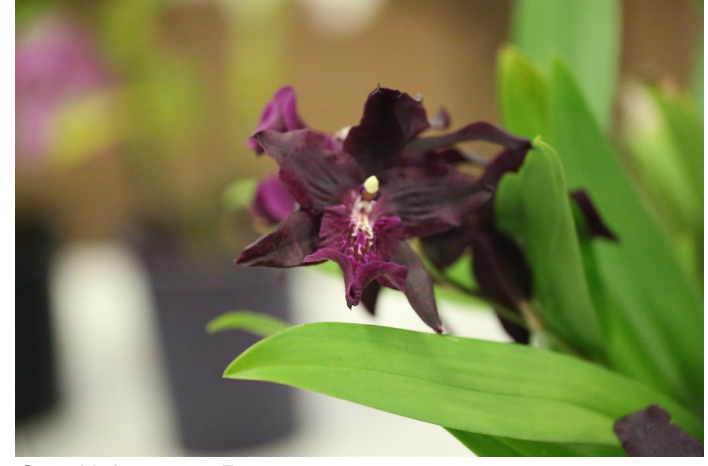
Onc. Unknown - Popy