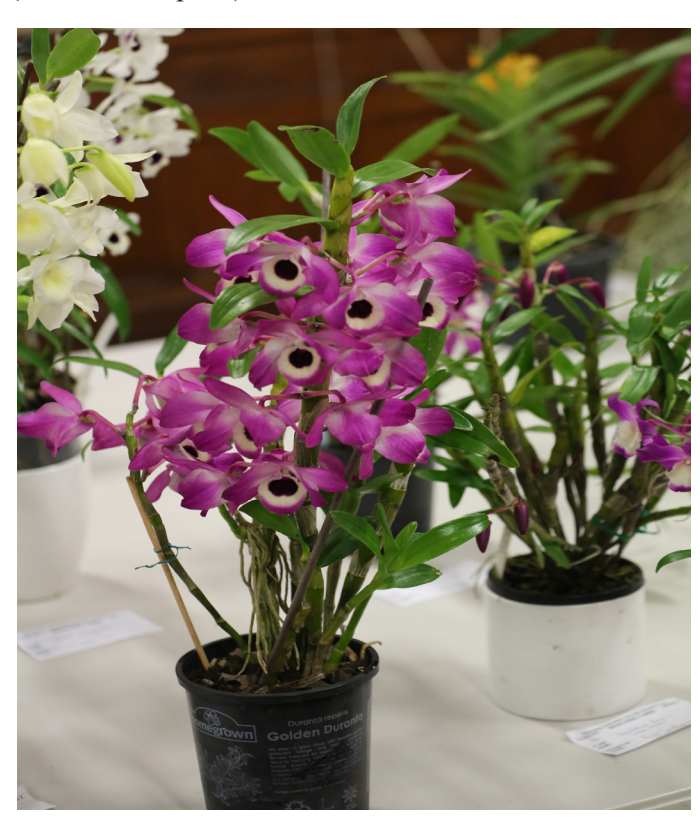
Dendrobium Unknown Kalliopi Kalogerakis