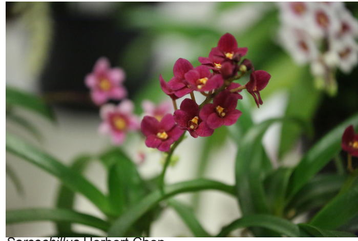
Sarcochillus Herbert Chen