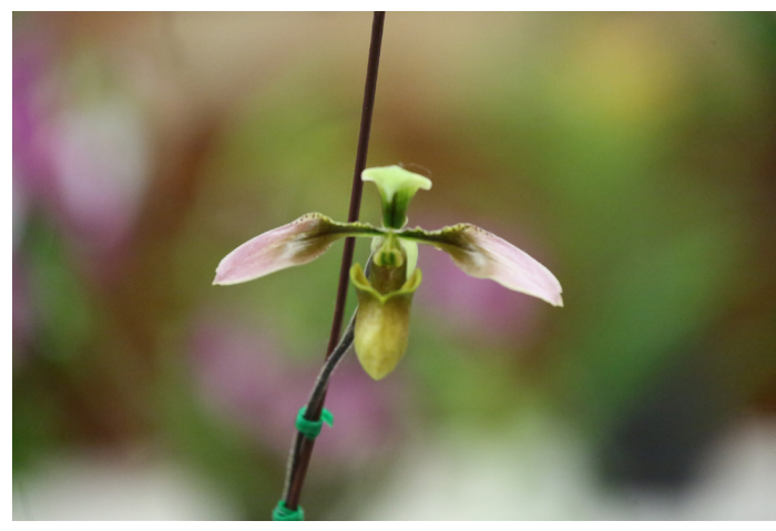
Paph. appletonianum Chin Wong