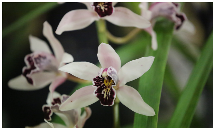
Cymbidium sandrae - Warleiti Jap