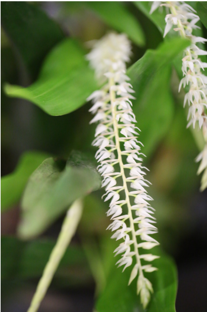
Coelogyne nivea - Warleti Jap