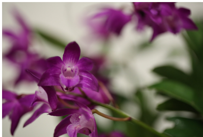
Ludesia discolor

The next ESOS General Meeting will be convened on Mon 19th September 2022 at 7.30pm + Annual General Meeting on that same day at 8.45pm, at the St Luke's Community Hall, cnr Arden & Varna Sts Clovelly.