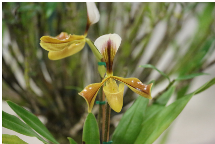
Paph. villosum - Warleiti Jap

The views stated in this bulletin are not necessarily the views of The Eastern Suburbs Orchid Society Inc. but are the views expressed by the individual authors and contributors. The Eastern Suburbs Orchid Society Inc. authors & contributors to this bulletin disclaim all liability for damage or losses which may be contributed to the use, misuse or non-use of any information or material published in this bulletin.