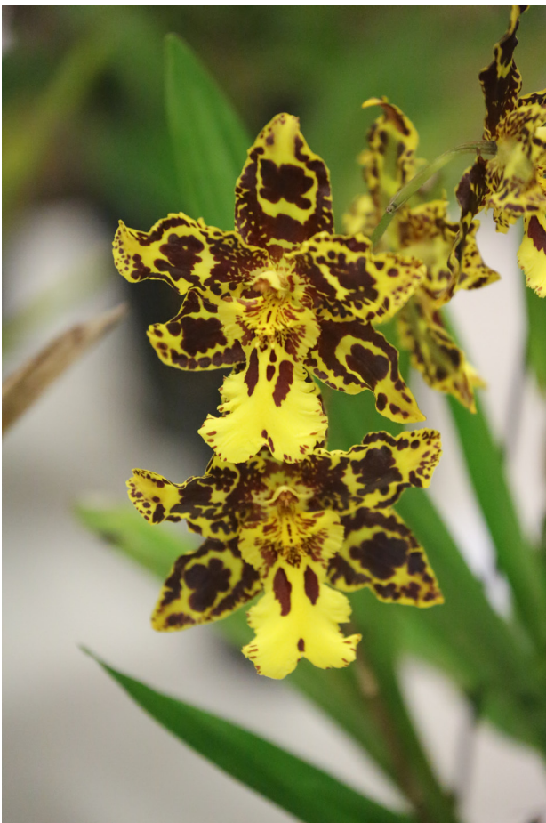
Onc. Pui Chin 'Flying Tiger' - Herbert Chen