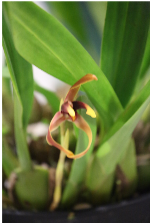
Max. nigrescens - Warleti Jap