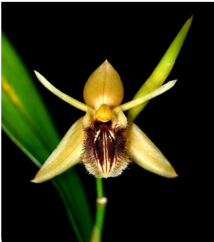
Coel. ovalis Art Vogle - Orchid Wiz