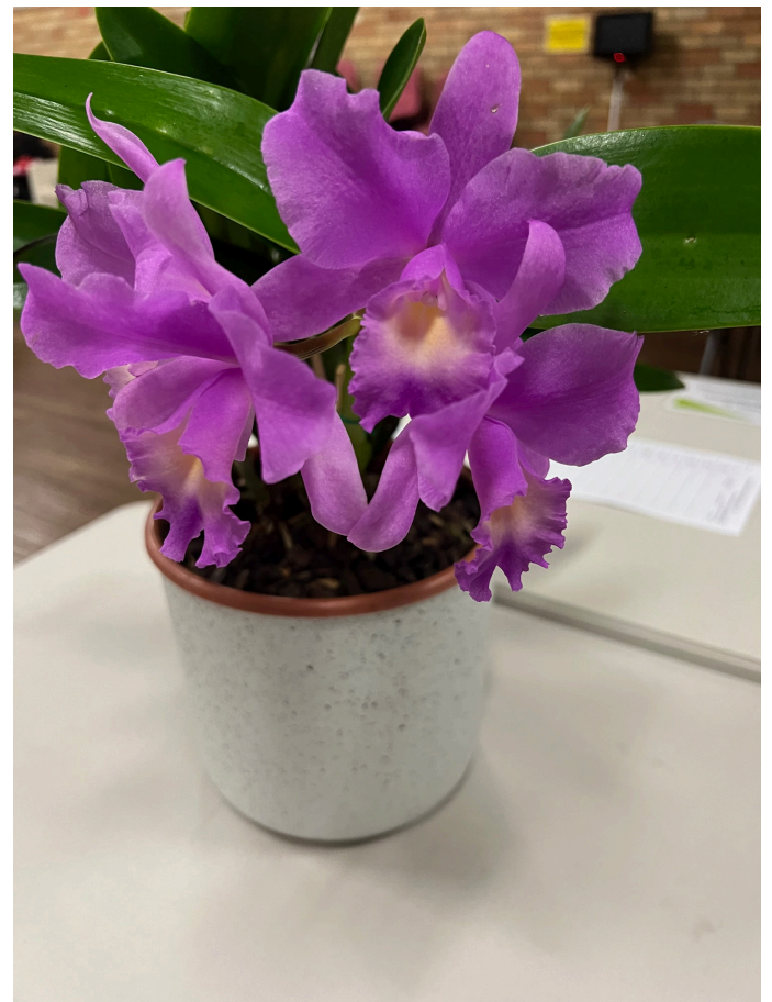
Brassocatanthe Little Mermaid 'Janet' - H Chen