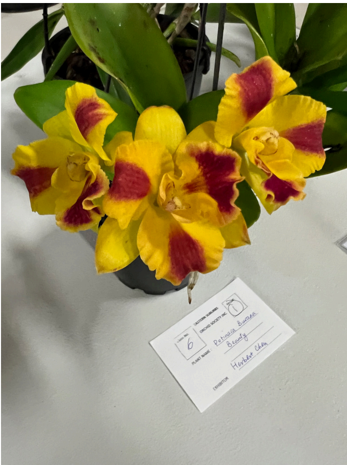
Rth. Burana Beauty -- H Chen