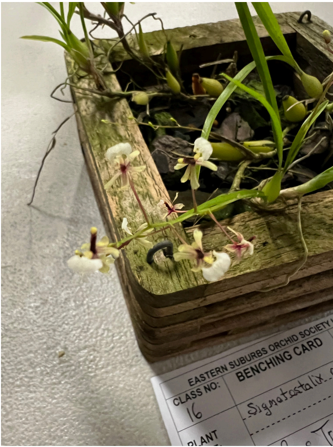
Sigmatostalix radicans - Ross Trethewy