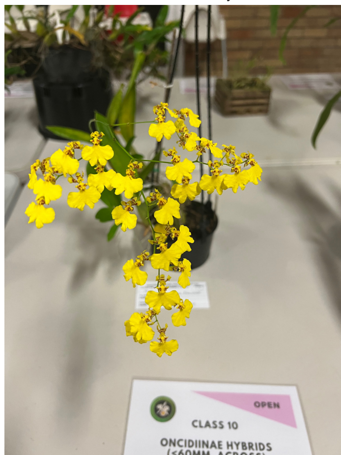
Gomesa flexulosa