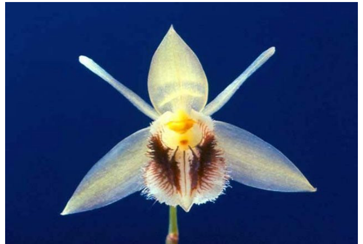
Coel. fimbriata - O'Shaughnessy OrchidWiz