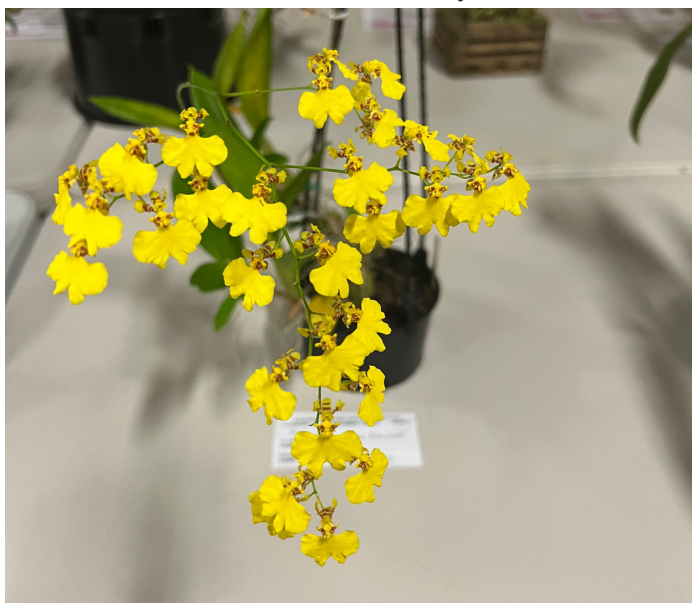
Gomesa flexulosa