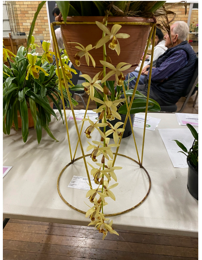
Coel. tomentosa - Chin Wong