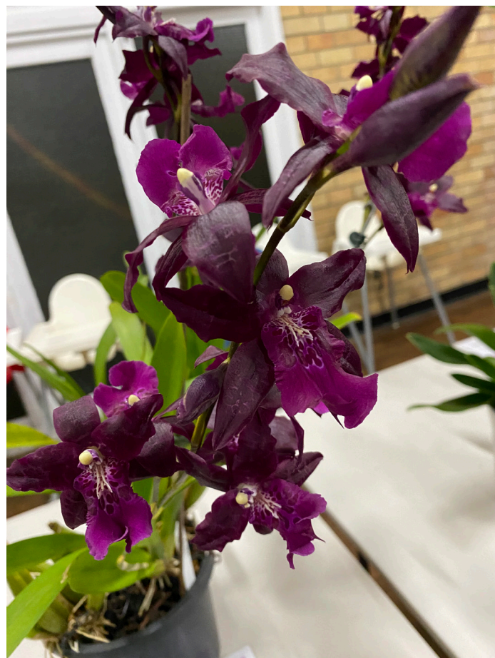
Onc. Unk. - - Kalliopi Kalogerakis