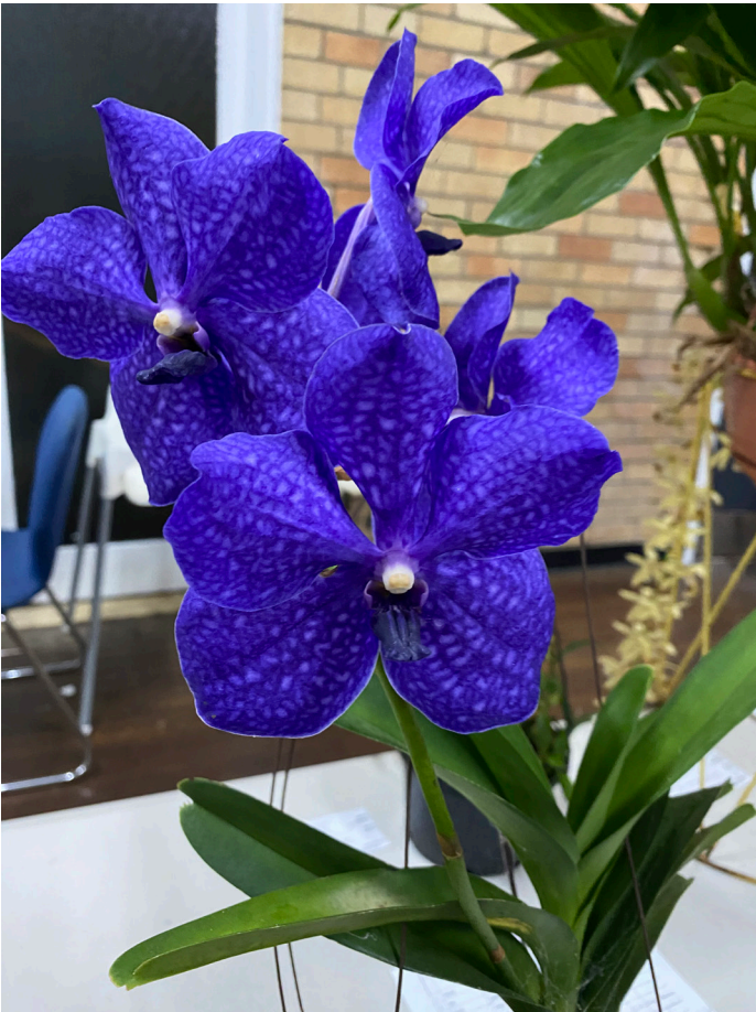
V. Pachara Delight 'Blue' - Chin Wong