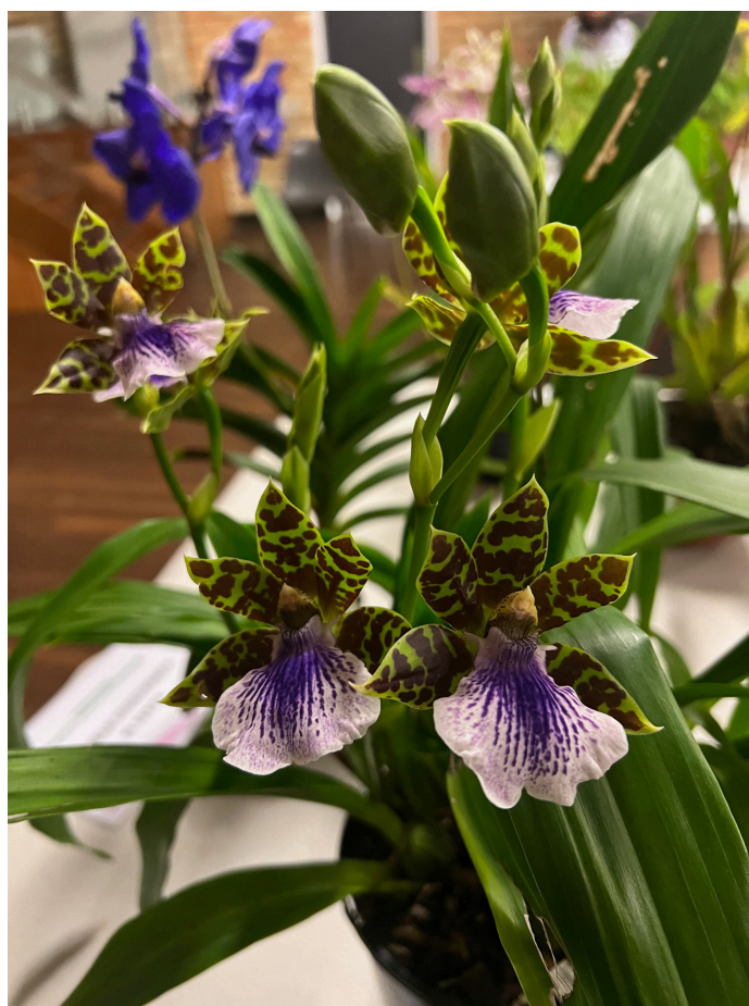
Zygopetalum Elle Tombstone - Ross Trethewy