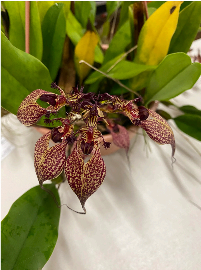
Bulb. rothschildiana - Herbert Chen