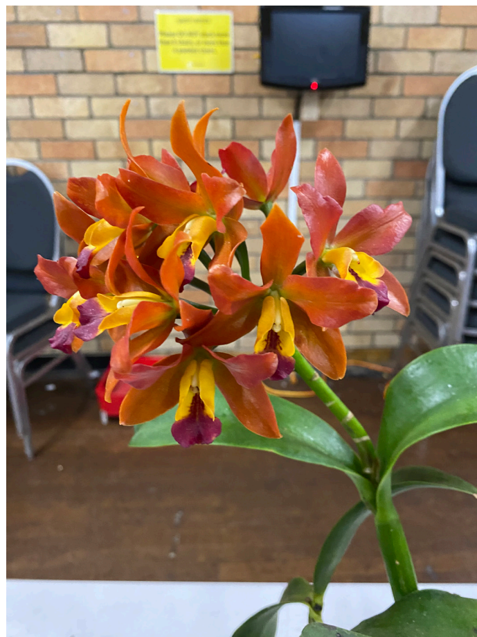
Onc. Pacific Sunset 'Hakola' - Kalliopi Kalogerakis