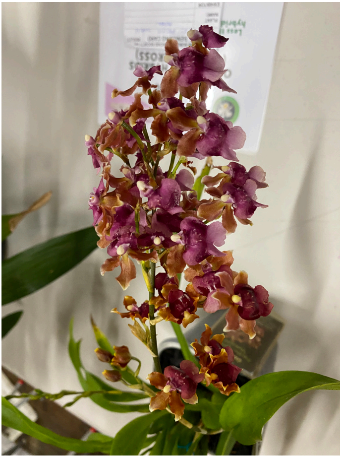
Onc. Pacific Sunset 'Hakola' - Kalliopi Kalogerakis