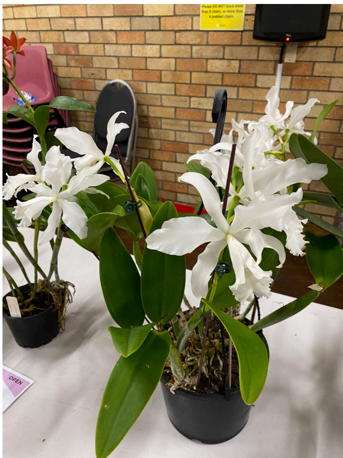
Lc. Snow White-- - Kalliopi Kalogerakis