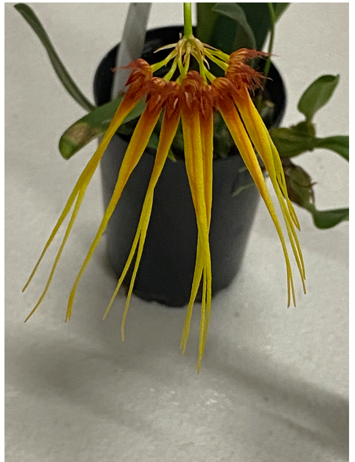
Bulb. hirundinis - Chin Wong