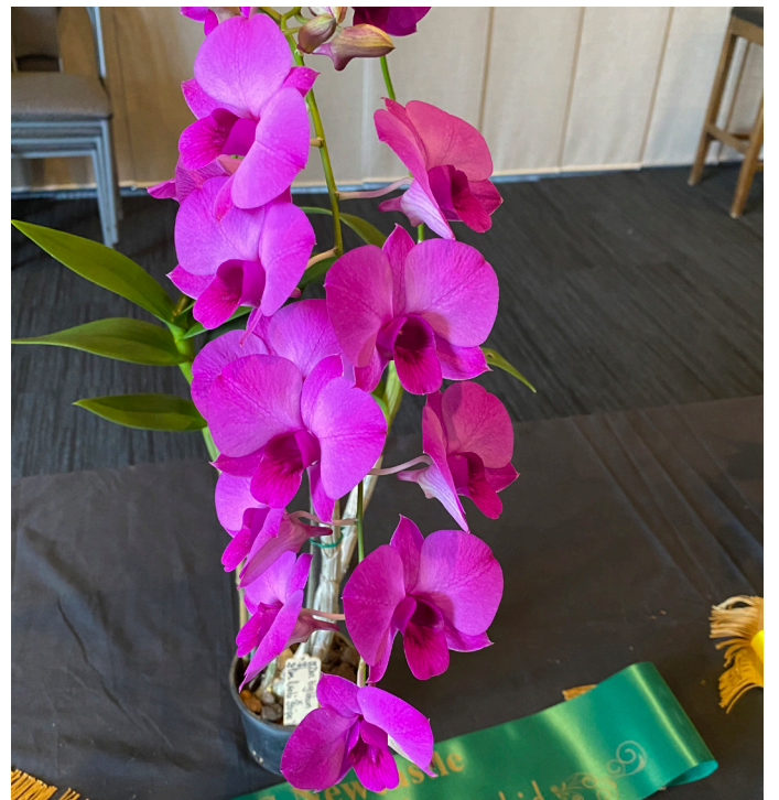
Dendrobium hybrid probably with Top Hat in the background, often benched as Den. bigibbum

There are a lot of intervrietal crosses and hybrids sold and benched as the species.