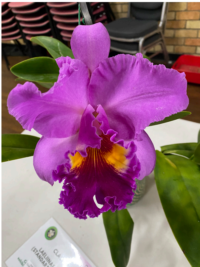
Rlc. Goldenzelle 'Dorothy Gorton' - Kalliopi Kalogerakis