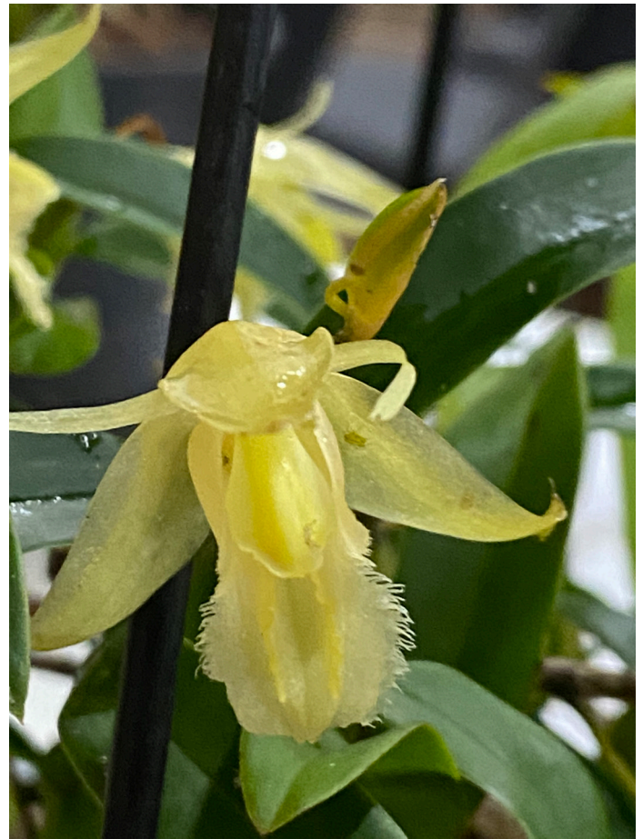
Coel. fimbriata