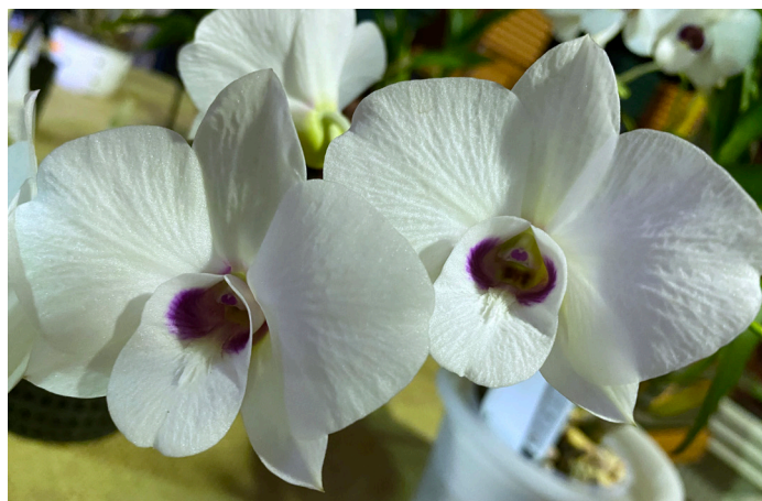
Dendrobium hybrid often benched as Den. bigibbum

Den. bigibbum var. compactum - its range is restricted to a small area In the ranges between Cairns and Daintree. Synonyms: Dendrobium lithocola , Dendrobium phalaenopsis fma. compactum .