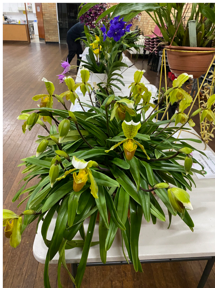
Paph. insigne - Chin Wong