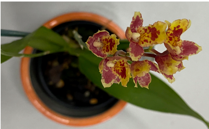
Leomesezia Lava Burst 'Pacific Sunrise'