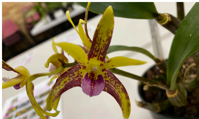
Den. Regal Gillerston X (Rutherford Starburst X Brimbank)