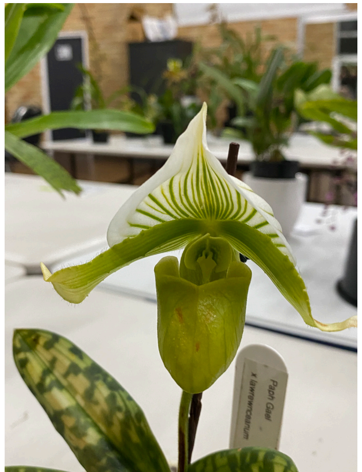
Paph. Hung Sheng X .....