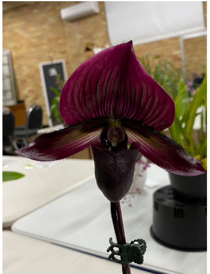
Paph. Gael X Lowre winceanum