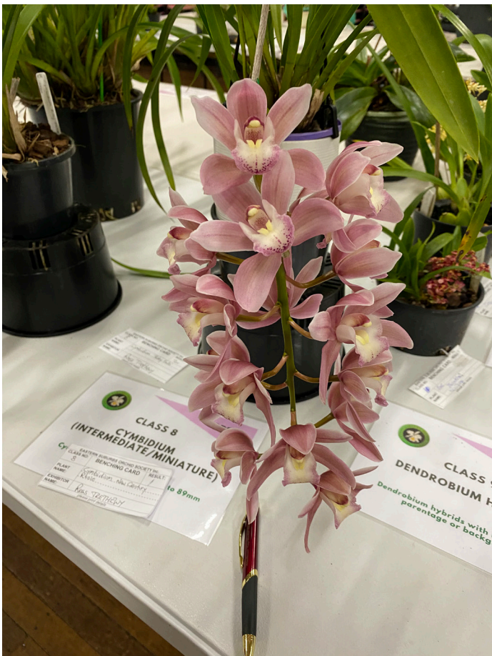
Cym. New Century