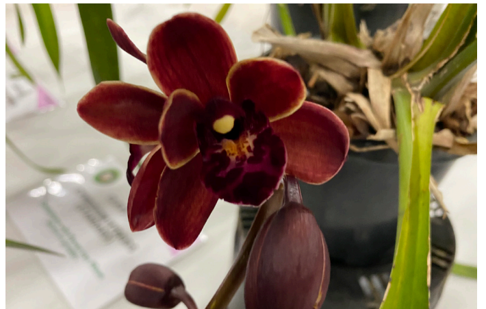
Cym. Ruby Falls