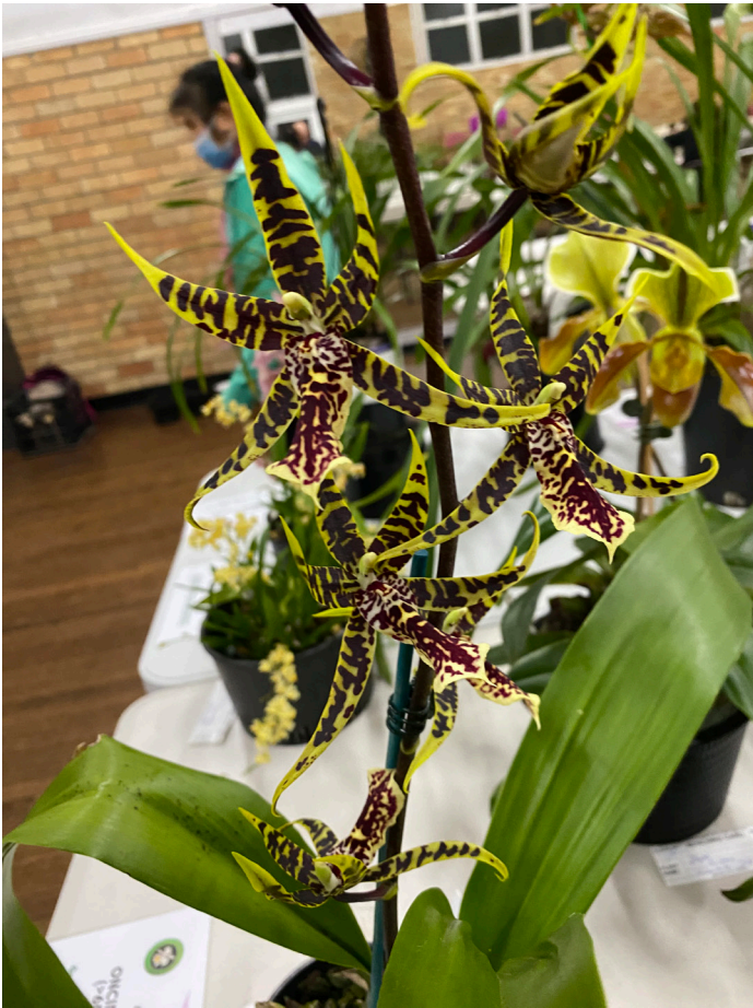
Arthurara Sea Snake 'Unforgettable'