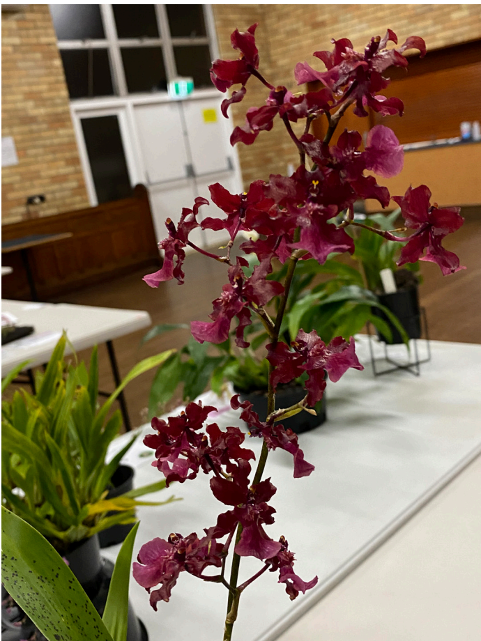
Onc. Sharry Baby