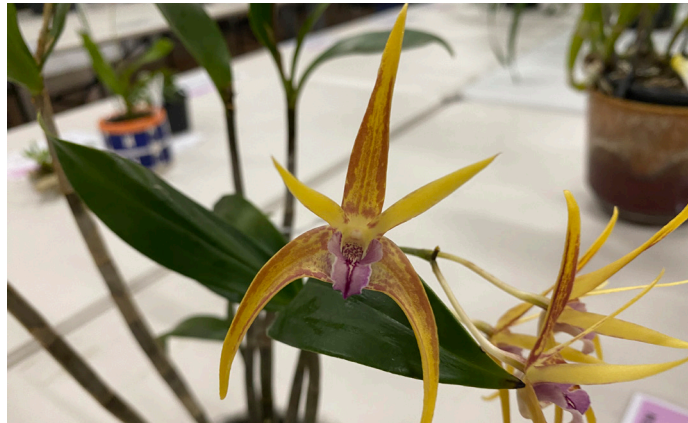
Dendrobium Rutherford Starburst