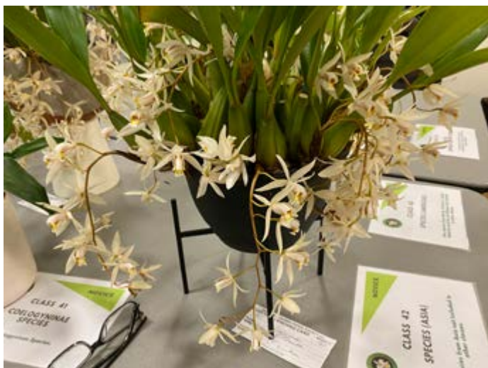
Coelogyne flaccida

World Checklist of Selected Plant Families.Lit,