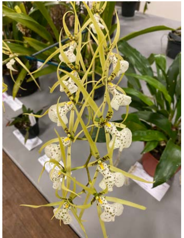
Brassia verrucosa