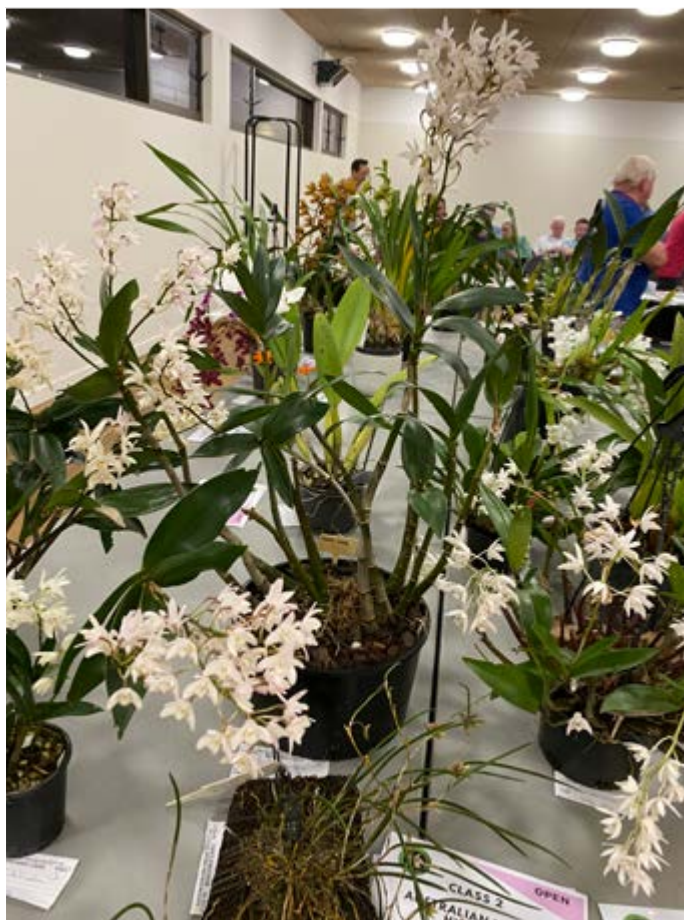
Dendrobium Specio-kingianum