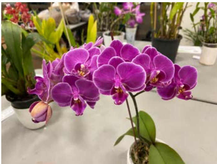
Novice plant of the night Phalaenopsis UNK -- Lily Huang