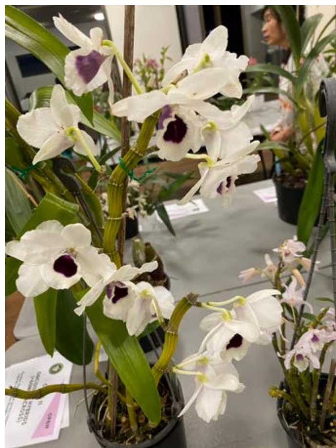
Dendrobium Yukidorama 'The King' -- Chin Wong