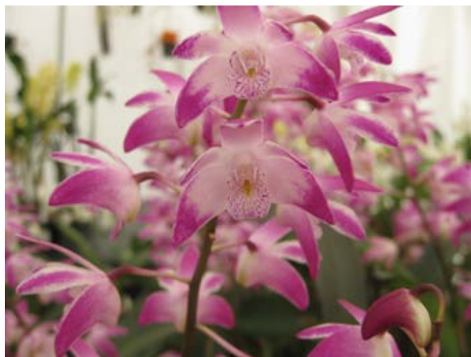
Den. Delicatum ( Speciokingianum ) 'Big Red' HCC/NSW