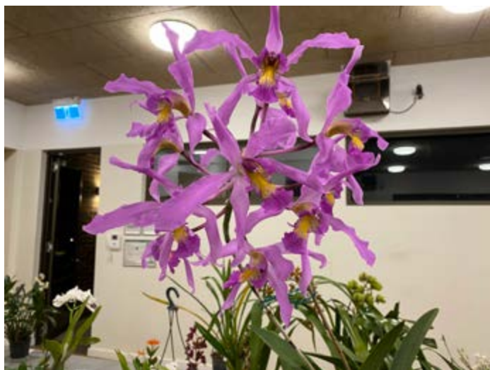
Open Plant of the night Laelia superbiens -- Ross Trethewy f

1 DAY LANE KENSINGTON Early start 7.00pm