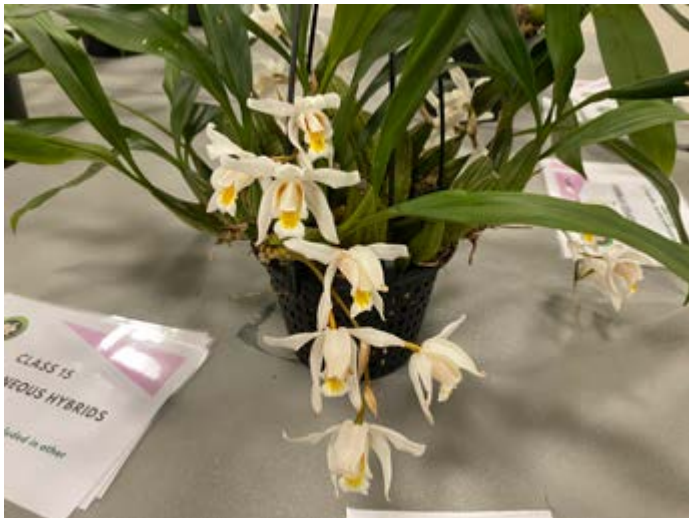
Coelogyne Unchained Melody -- Chin Wong