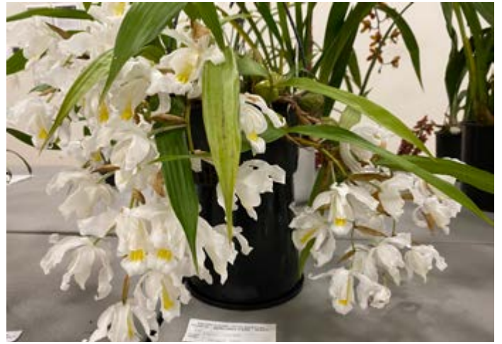
Coelogyne cristata -- Herbert Chen