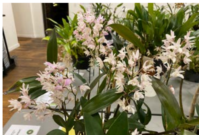
Dendrobium Speciokingianum -- Buda Ivanisevic