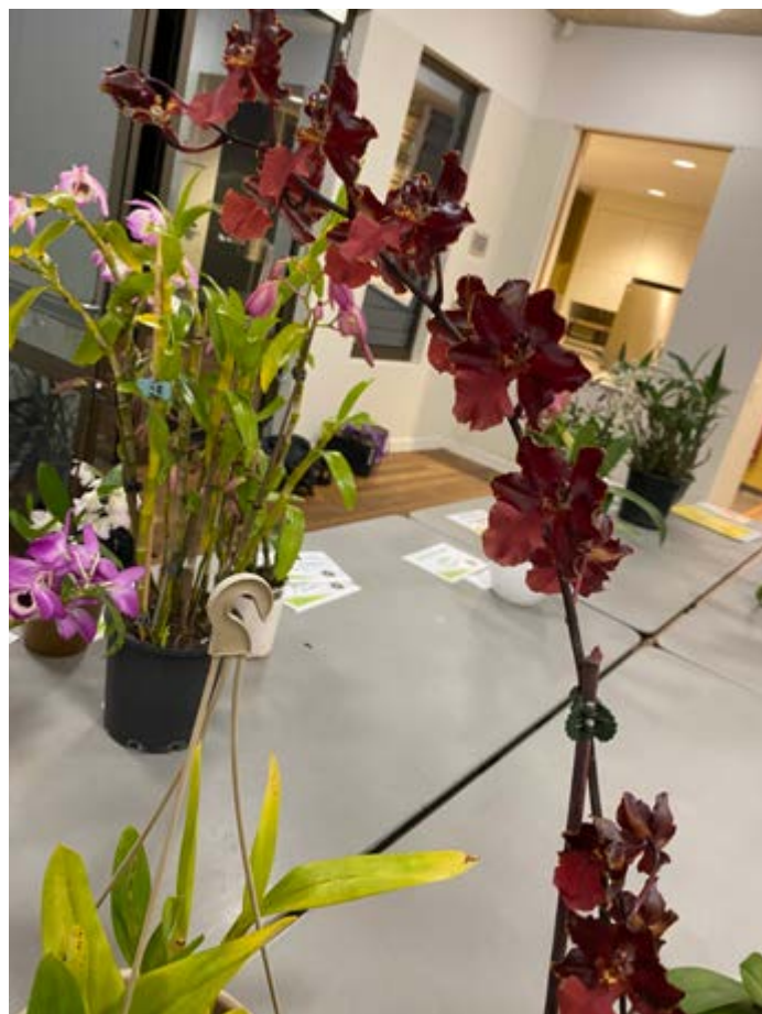
Onc. Unknown -- Chao Ping Li