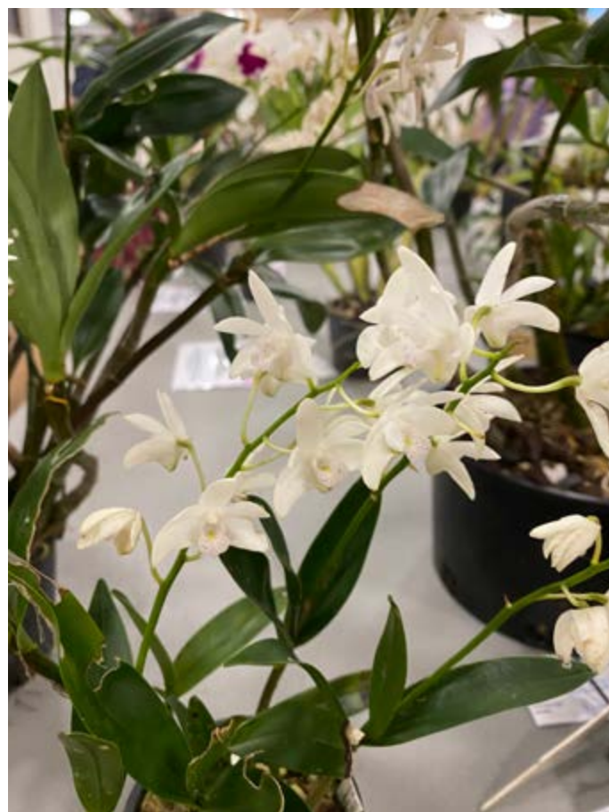
Dendrobium Specio-kingianum --Chin Wong

The next ESOS General Meeting will be convened at 7.00pm on 16 October 2023 at Hall 1 located at the Kensington Community Centre 1 Day Lane Kensington .