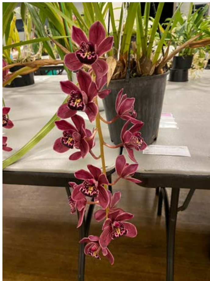
Cym. Ten Pin 'Tee Pee' -- Herbert Chen