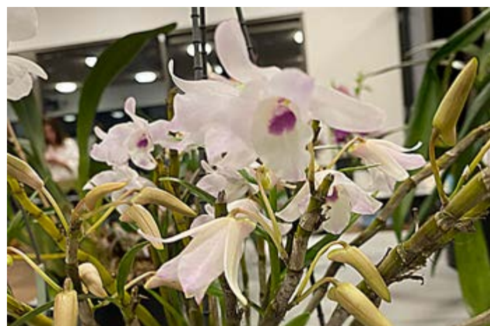
Dendrobium Unk - Herbert Chen