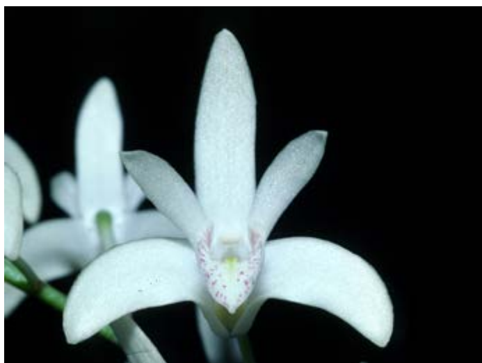
Den. x delicatum 'Honey Pot' ACC AOC/NSW