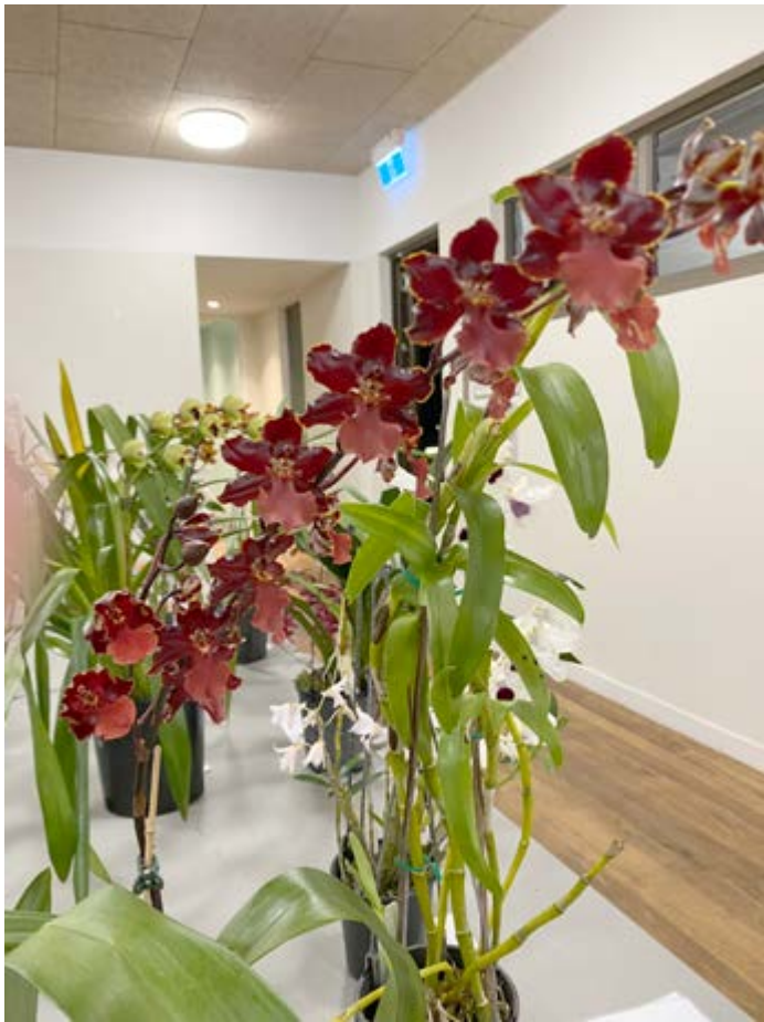
Onc Unk -- Chin Wong