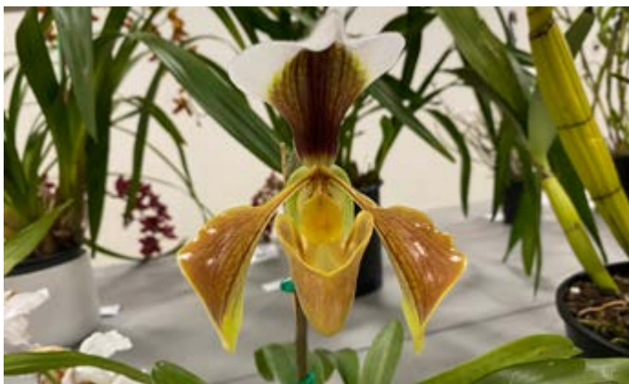
Paphiopedilum villosum -- Chin Wong