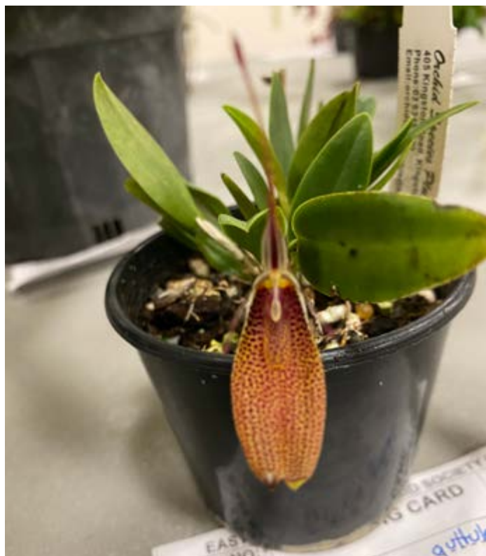
Restrepia guttata -- Ross Trethewy