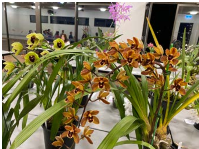
Cym. Mad Magic 'Amber'