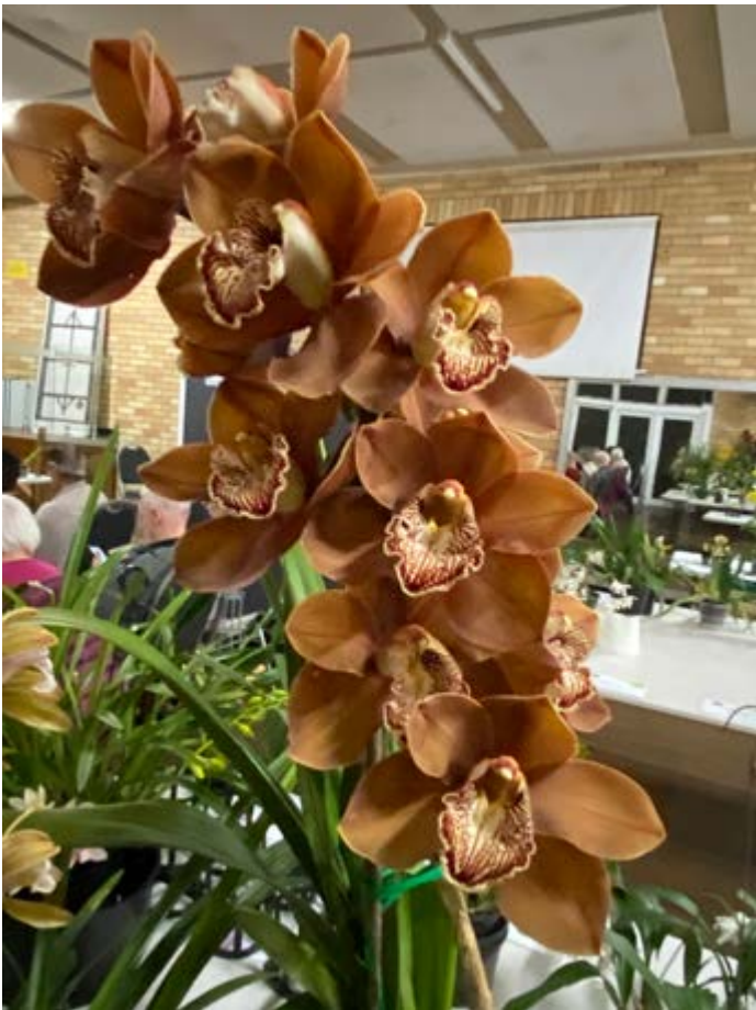
Cym. Apache Flame