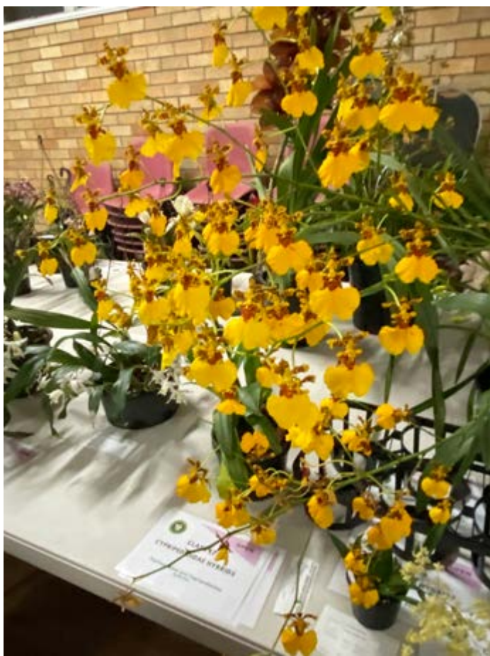
Plant of the Night Open - Oncidium Singapore Delight owned by Herbert Chen.