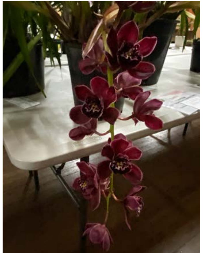
Cym. Ten Pin 'Tee Pee'