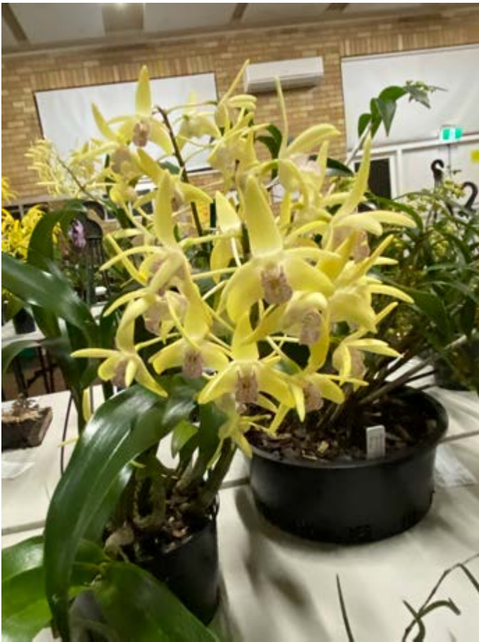
Dendrobium Hunter Sparkle