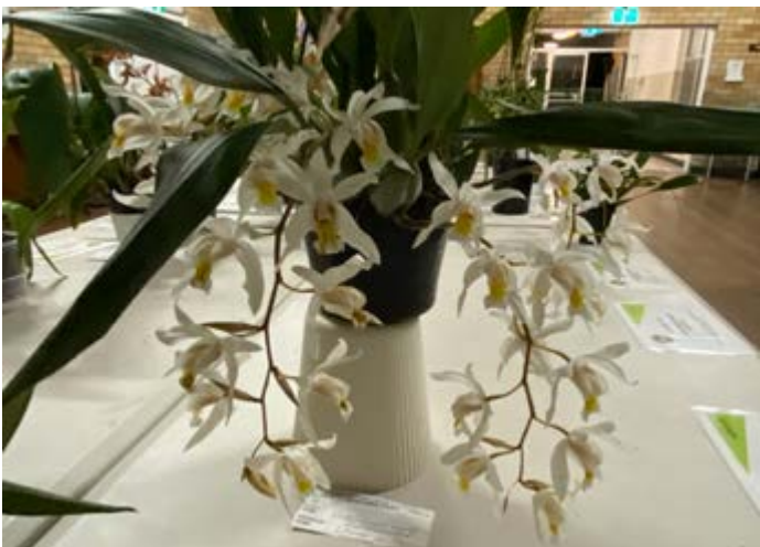
Coel. Unchained Melody