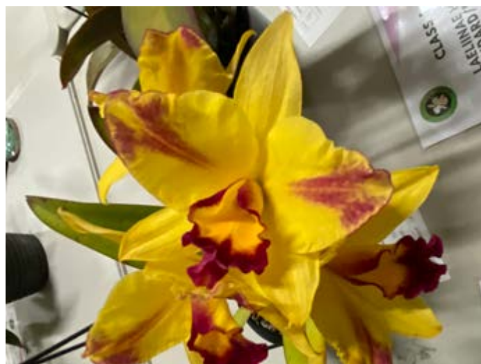
Rlc. Hsinying Sunbeam 'Auanti Gem'