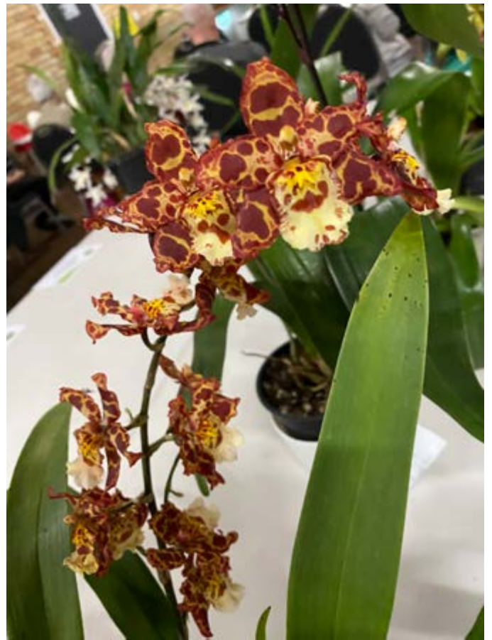
Oncostele Eye Candy 'Penny Candy'