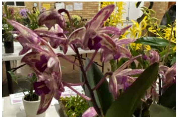
Dednrobium Cobber X AMBBI