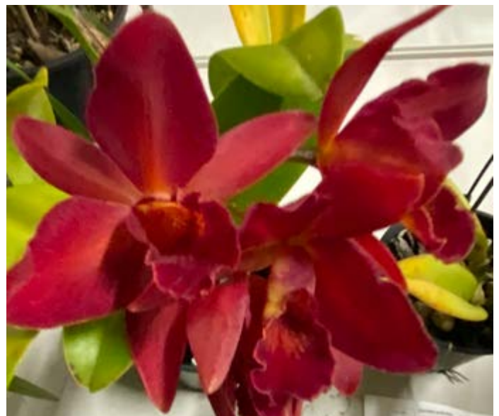
Ctt. Jewel Box ;Shinzu'