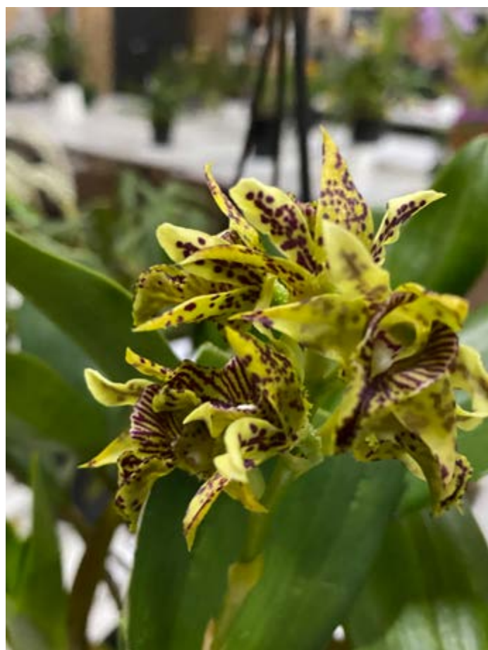
Den. New Guinea