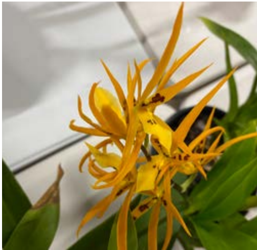
Brassia Memoria Bert Field