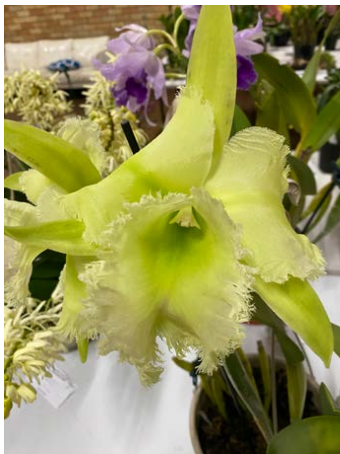
Rlc. Golf Green 'Hair Pig'