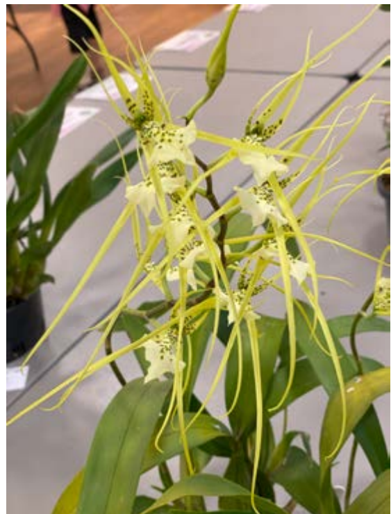
Open Plant of the night Brassia verrucosum -- Poppy K