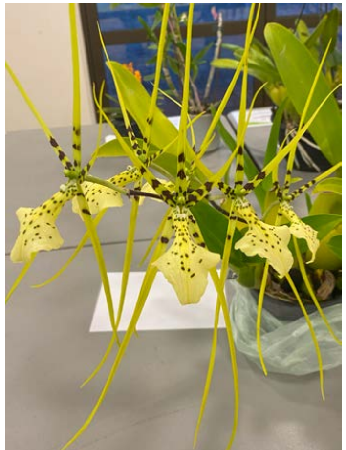
Guranthe aurantiaca 'Michima Spot'