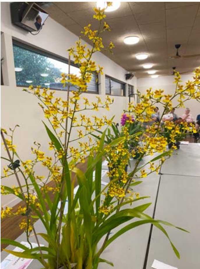
Onc. Planilabre hybrid