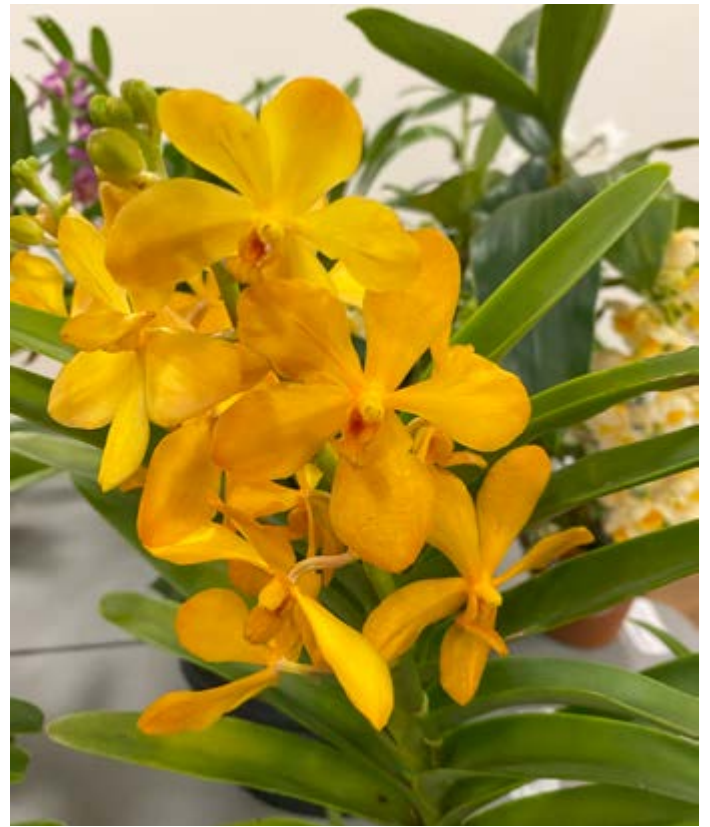
Mokara Moon Light