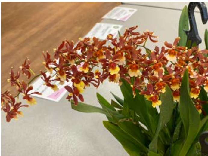
Onc. Hilo Honey

Red denotes Orchid of the Night Blue denotes Popular Vote