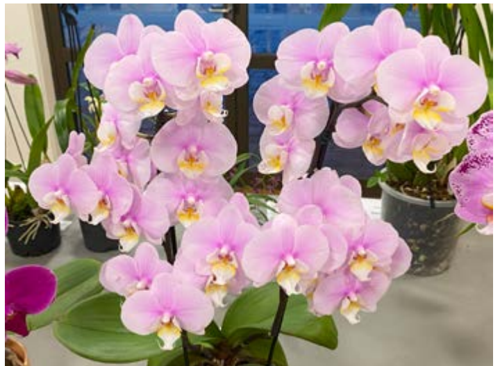
Novice plant of the night Phalaenopsis UNK -- Lily Huang