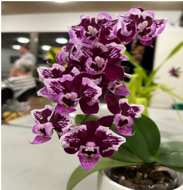
Phal. unknown Exhibitor: L Huang