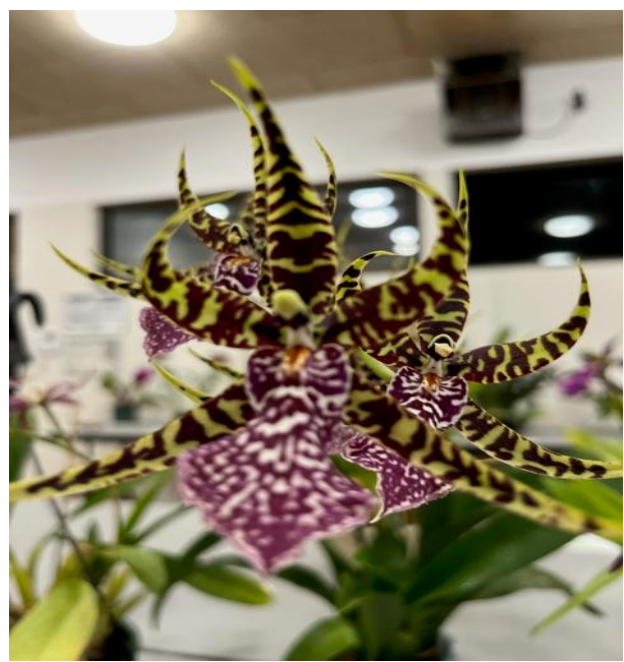
Arthurara Sea Snake 'Unforgettable' Exhibitor: L Huang