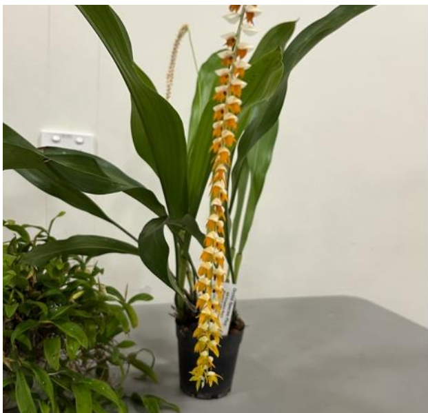
Coel. latifolia v macrantha Exhibitor: C Wong