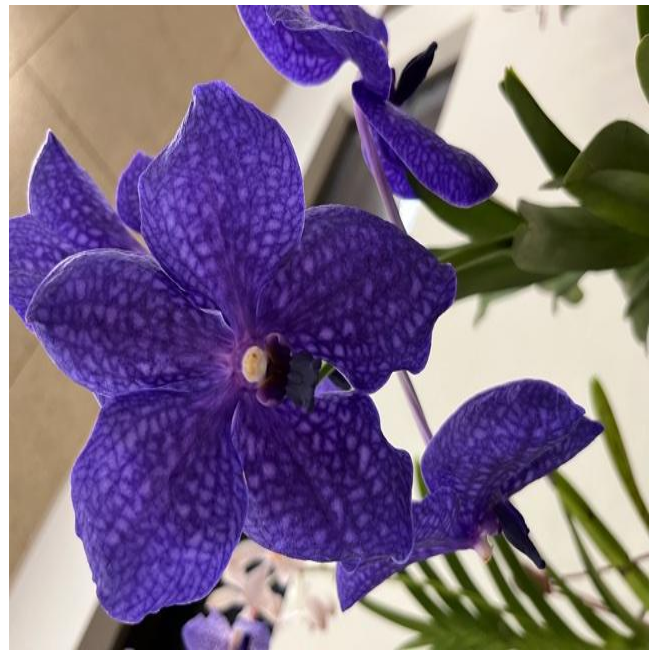
Vanda: Somsri Glory 'Blue' Exhibitor: R Trethewy