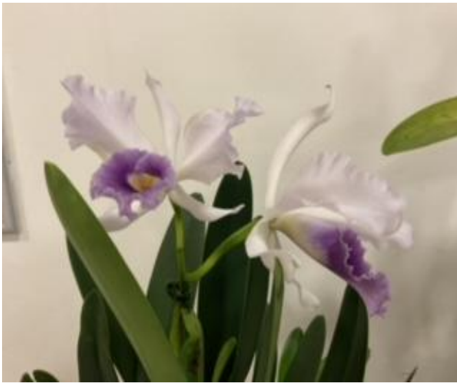
Lc. C B Roebling 'Beechview' Exhibitor: R Trethewy