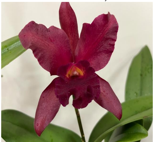
Catt. Nobiles Bruno 'Big Red' Exhibitor: R Trethewy