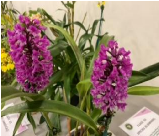
Aprophyllum spicatum Exhibitor: R Trethewy