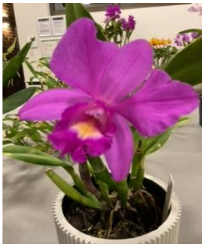
C Crystelle Smith x C walkeriana Neve Exhibitor: C Wong