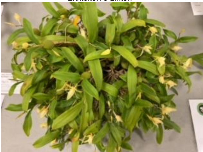
Coel. frimbriata alba Exhibitor: R Trethewy