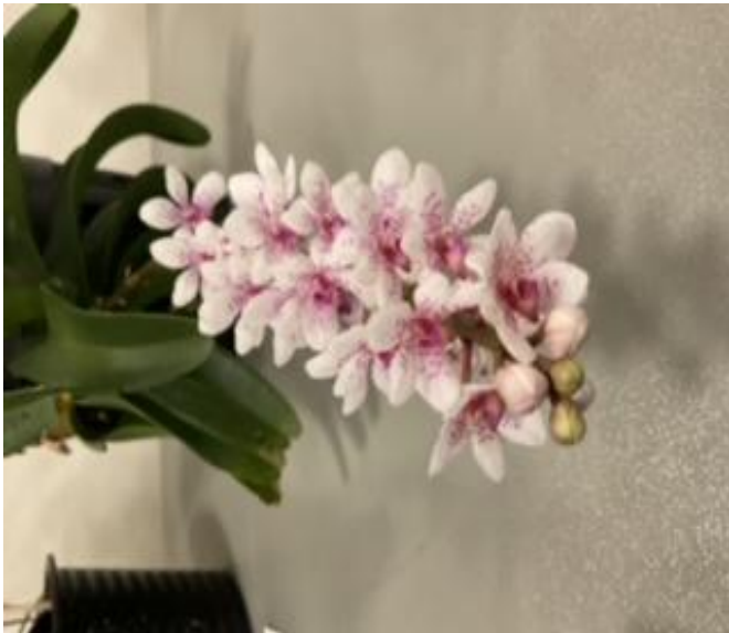
Sartylis 'Blue Knob' Exhibitor: R Trethewy