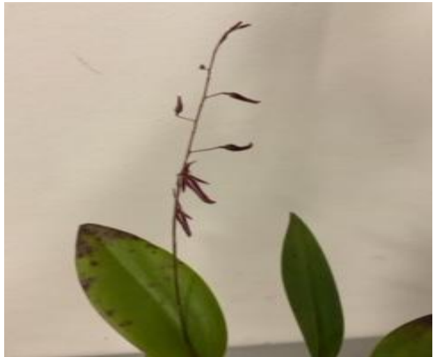
Pleurothallis stricta Exhibitor: R Trethewy