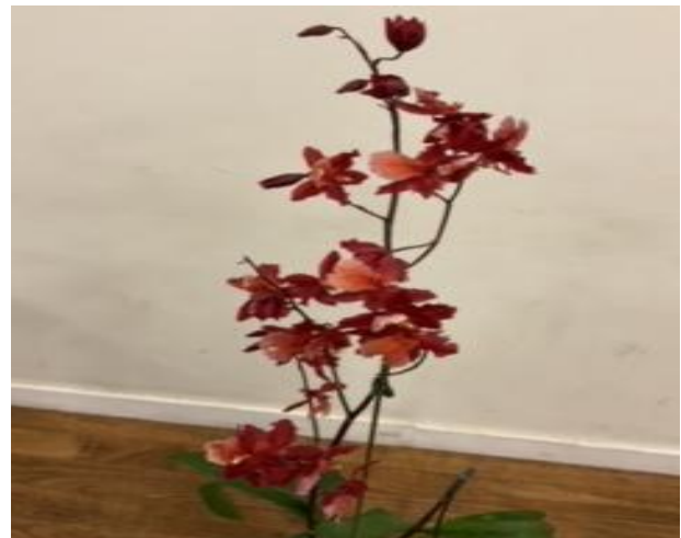
Onc. Pacific Red Heat Exhibitor: Chaoping Li