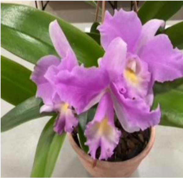
Catt. Susie's Delight x Hawaiian Wedding Song Exhibitor: C Starrett