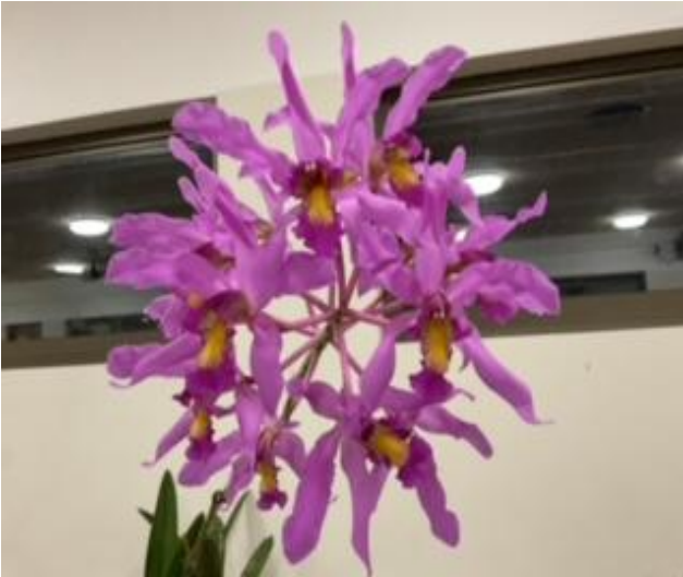
Laelia superbiens Exhibitor: Ross Trethewy