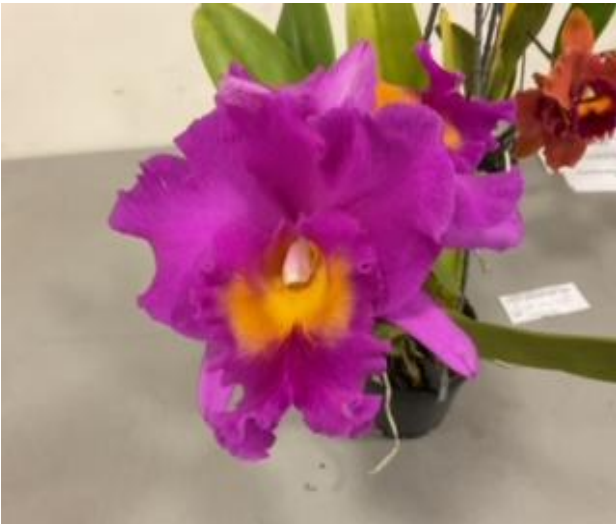
Catt. Pink Empress Exhibitor: H Chen