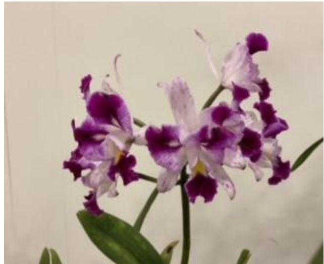
Lc. Purple Cascade Exhibitor: R Trethewy