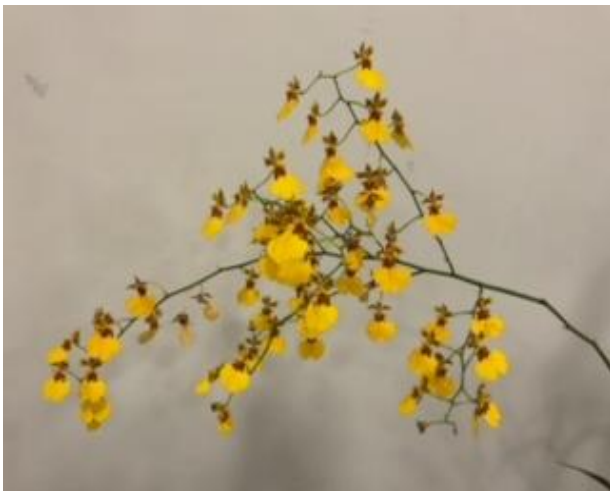
Onc. Singapore Delight Exhibitor: H Chen