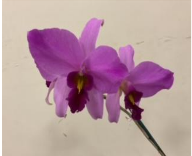
Laelia anceps 'Wallbrunn' x 'Roseminah' Exhibitor: C Starrett