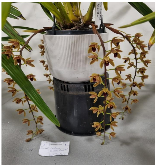
Cymbidium Cricket Rosita Exhibitor: R Trethewy