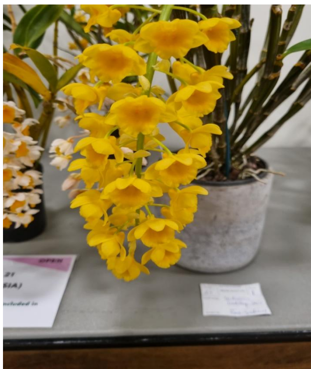
Dendrobium densiflorum Exhibitor: R Trethewy