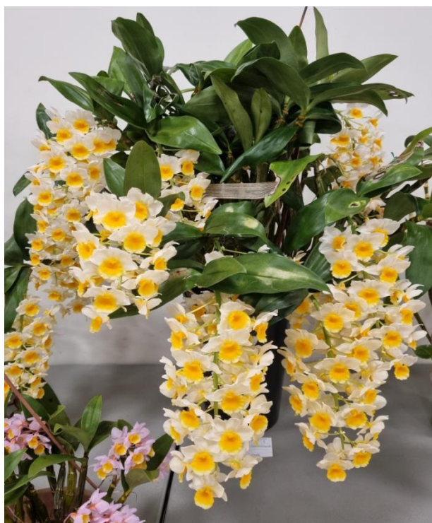
Dendrobium Cream Cascade Exhibitor C Wong (Peoples' Choice)