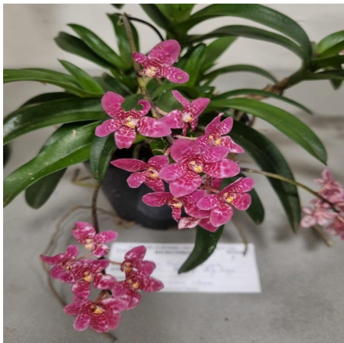
Sarc. Kulnura 'Ripple' x Sarc. Bunyip 'Big Edge' Exhibitor: H Chen