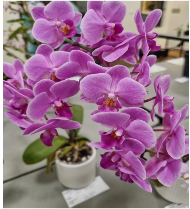
Phal. unknown Exhibitor: L Huang