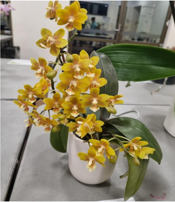
Phal. KS Balm Yellow Chocolate Exhibitor: Yopi Lim